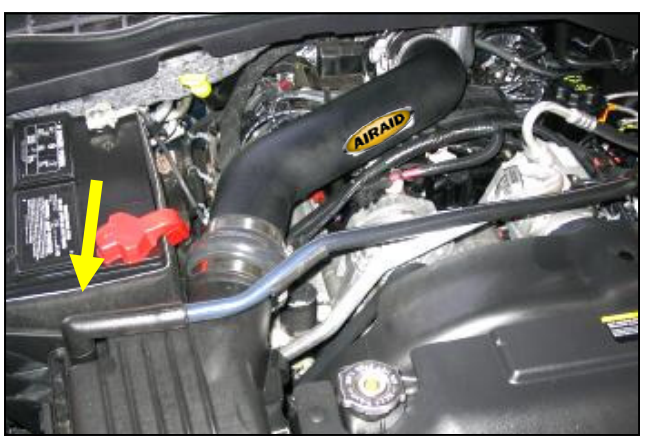
11. Adjust hose assembly for final position and tighten all four hose clamps. Reconnect valve cover breather hose to air box lid and replace oil fill cap.