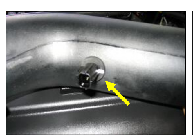
7. Install the supplied grommet and factory air temperature sensor into the Airaid MIT.