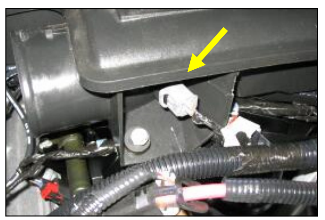
3. Carefully disconnect electrical connector from air temperature sensor in factory housing.