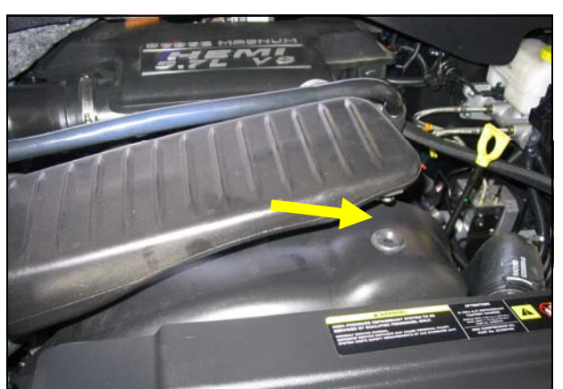
2. Unsnap factory air box tube baffle from fan shroud and remove air tube assembly from vehicle.