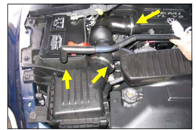
1. Disconnect The Negative Battery Terminal! Remove valve cover breather hose from air box lid. Loosen hose clamps on both sides of factory intake tube.