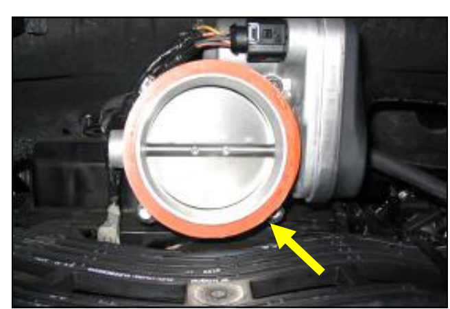
6. Remove factory orange seal from throttle body.