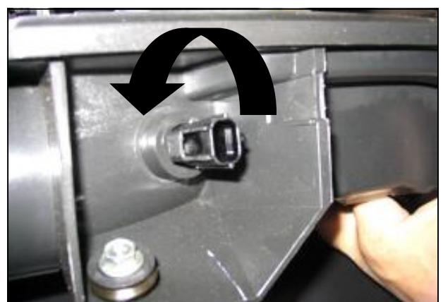
5. Remove air temperature sensor from housing by turning counter clockwise and pull.