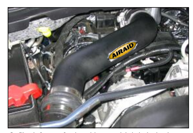
9. Check for any foreign objects or debris it the intake path & install Airaid MIT assembly on engine. ( Note: Leave hose clamps loose until final assembly ) Apply the Airaid Bubble Decal onto the Intake Tube as shown.