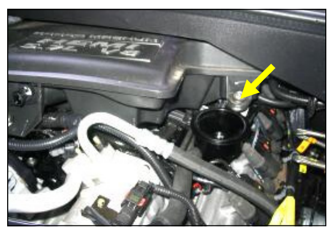
4. Remove oil fill cap from valve cover. Using 10mm socket, loosen two factory housing bolts. Remove housing from engine.