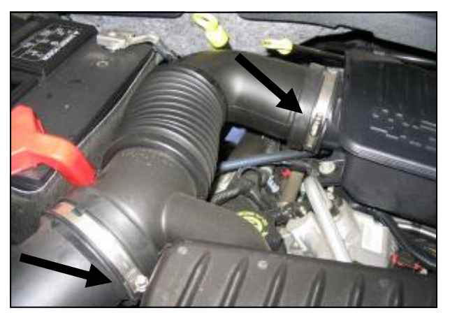
2. Loosen the two hose clamps on each end of the factory intake tube.