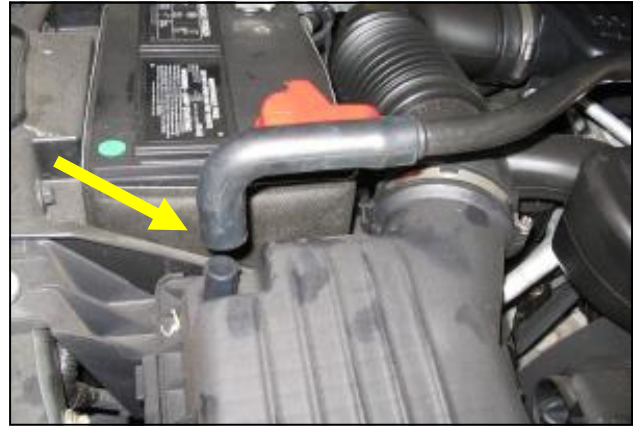
1.Disconnect The Negative Battery Terminal! Remove the breather hose from the factory air box lid.