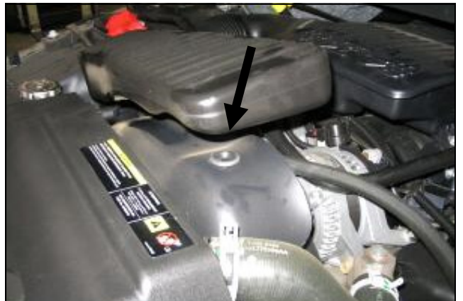
3. Unsnap the factory silencer box from the fan shroud and remove the factory tube assembly from the vehicle.