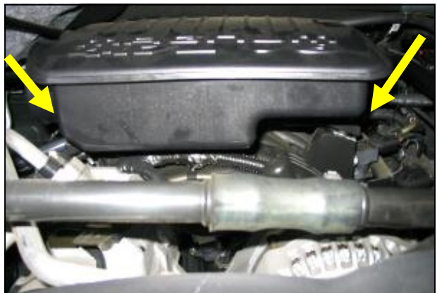
5. Loosen the two 10mm bolts mounting the factory air box to the intake manifold and remove from vehicle.