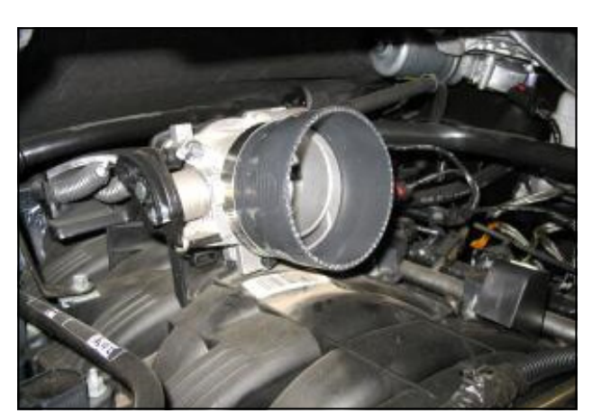
7. Install the reducer hose and a #52 hose clamp onto the throttle body. Install a #56 hose clamp onto the other side of the reducer.