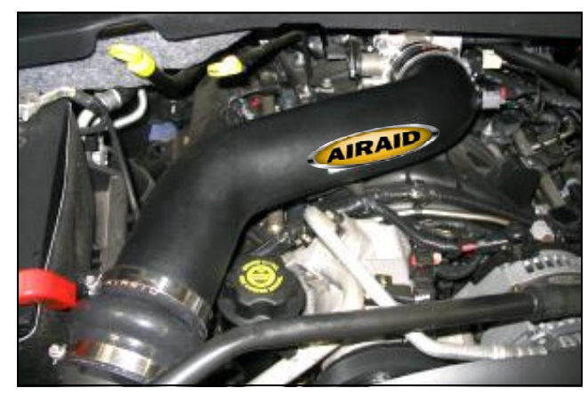
9. Install Airaid intake tube assembly by connecting the Airaid hump hose onto the factory air box lid and the other end onto the Airaid reducer hose. Tighten all hose clamps. Apply the Airaid Bubble Decal onto the Intake Tube as shown.