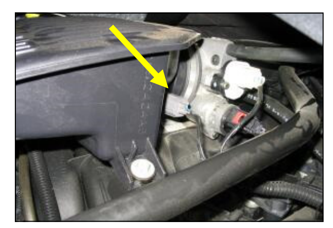
4. Disconnect the factory electrical connector from the factory air temperature sensor.