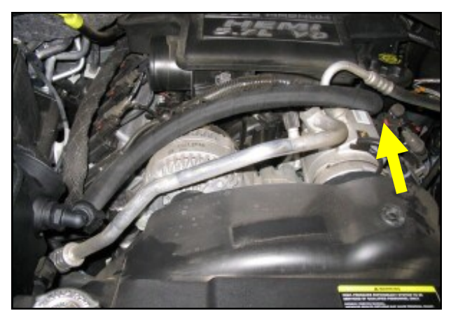
8. 5.7 Hemi engines only . Using the supplied straight <sup>3</sup>/<sub>4</sub>" hose, connect both ends to the nylon fitting and oil fill nipple as shown. Fasten both ends using the supplied nylon speed clamps. Adjust the nylon fitting downward to clear the factory intake tube assembly.