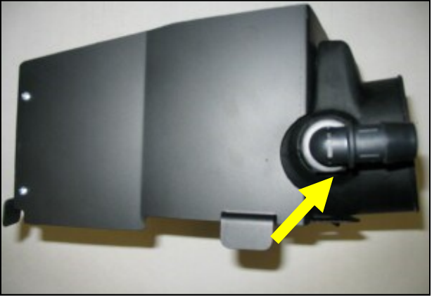
5. Install the supplied nylon fitting into the air filter adapter as shown.