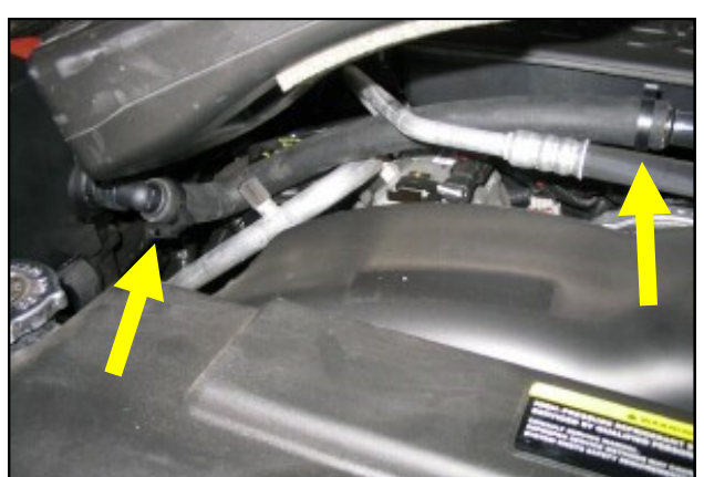
7. 4.7L engines only . Using the supplied preformed 3/4" hose, connect the nylon fitting to the remaining plastic factory hose as shown. Fasten both ends of the hose using the supplied nylon speed clamps. Adjust the fitting downward to clear the factory intake tube assembly.