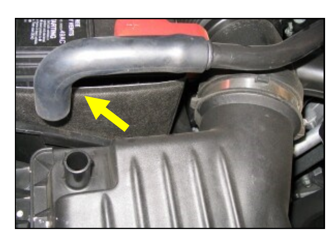
1.Disconnect The Negative Battery Terminal! Disconnect the factory breather hose and remove from the vehicle. (Note: 4.7L engines require the removal of the breather hose end section only. 5.7L Hemi required removal of entire hose assembly.