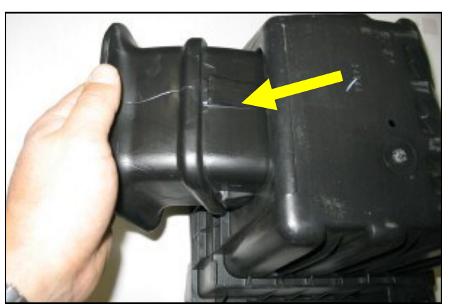
3. Using a 13mm socket, remove the air box base from the engine compartment. Using a flat blade screwdriver, carefully unsnap the box inlet from the base and remove it. Reinstall the factory base in the engine compartment without the inlet.