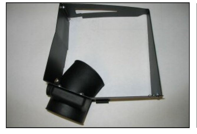
4. Using the supplied #6 screws, nuts and washers, assemble the two panels as shown above. Next, install the supplied air filter adapter using the supplied ½-20 bolts and washers.