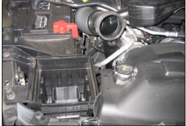
2. Loosen the hose clamp on the air box lid and remove the lid from the air box base.