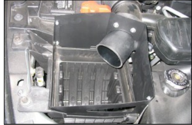
6. Install the Airaid Cool Air Dam assembly on top of the factory air filter base. Reconnect the factory intake tube, and tighten the hose clamp.