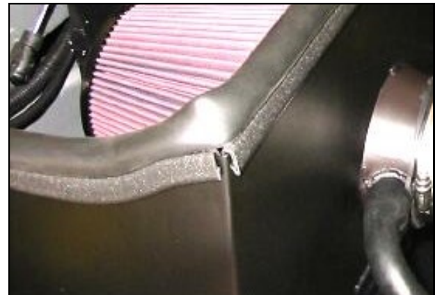
18. 2004-05 Models Only: Connect the factory breather hose to the Airaid Cool Air Dam & secure using the #24 Speed clamp provided.