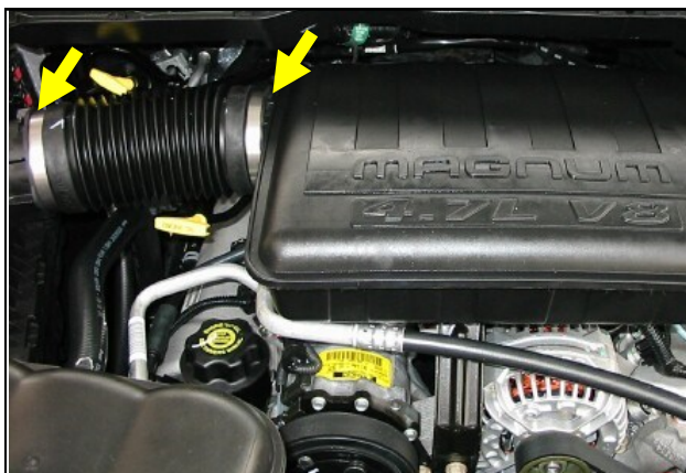
1. Disconnect The Negative Battery Terminal! Loosen the two hose clamps on the factory air tube.

Full color instructions can be viewed on our web site at Airaid.com . Use the Product Search function to find your part number, and click View Details .