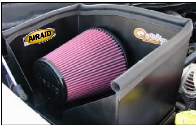
11. Mount the Airaid Premium filter inside the Cool Air Dam & secure with hose clamp provided. In addition, install the weather strip hood seal on the Cool Air Dam. (Hint: begin in a corner and work it on toward the ends)