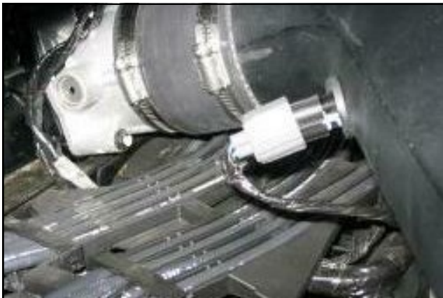
14. Re-connect air temperature sensor connector to the sensor in the Airaid tube.