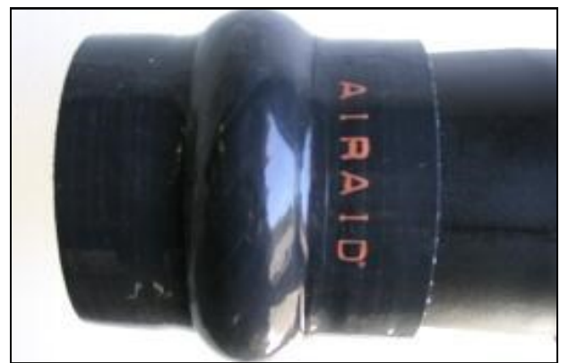
12. Install urethane hump hose onto the Airaid tube and secure using a # 60 hose clamp provided.