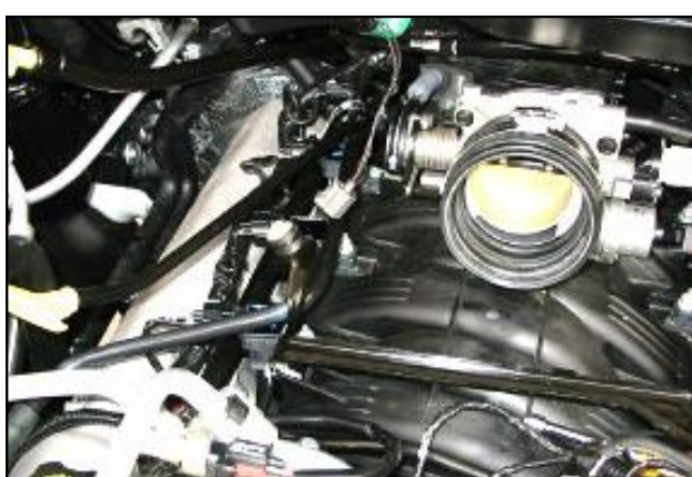
7. Unsnap the factory intake assembly from front of bracket and remove assembly from vehicle. (Note: leave the factory coupler on the throttle body)