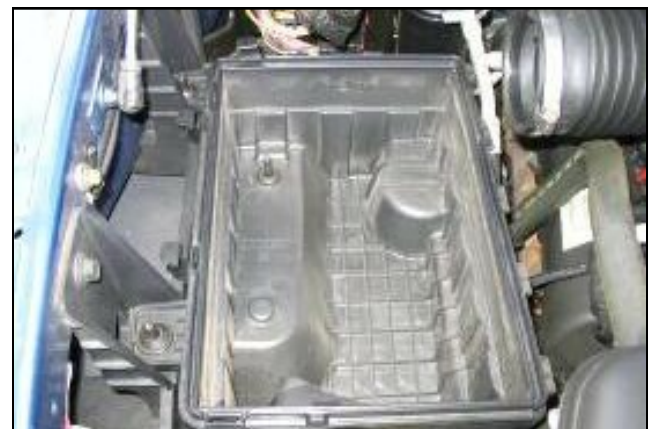
3. Unsnap and remove the factory air box lid, tube, & factory air filter.