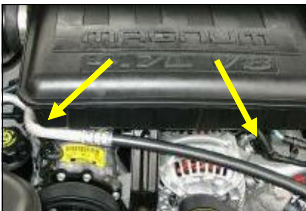
4. Loosen and remove the two 10mm bolts holding on the factory throttle body air chamber intake assembly.