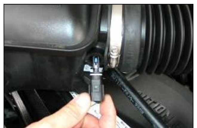
6. 2003-05 Models Only: Disconnect air temperature sensor wire on back of factory throttle body air chamber and remove sensor. Retain sensor for later use with the Airaid Intake System.