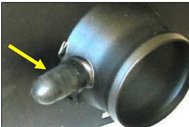
17. 2002 & 2003 Models Only: Slip the black rubber cap over the nipple on the Cool Air Dam and secure using the #19 Speed clamp provided.