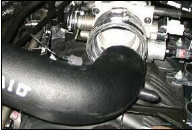
13. Position Airaid tube into place by connecting hump hose to Airaid Cool Air Dam and connect the other end of the tube to the factory throttle body coupler. Utilize the #60 hose clamps on the hump hose and #56 hose clamp on the factory coupler.