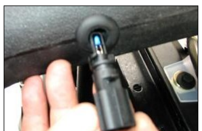
9. 2003-2005 Models Only: Install rubber grommet w/thru hole and insert the factory air temperature sensor into the grommet.