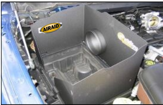
10. Position the Airaid Cool Air Dam in place of the original air box lid. Snap in place.