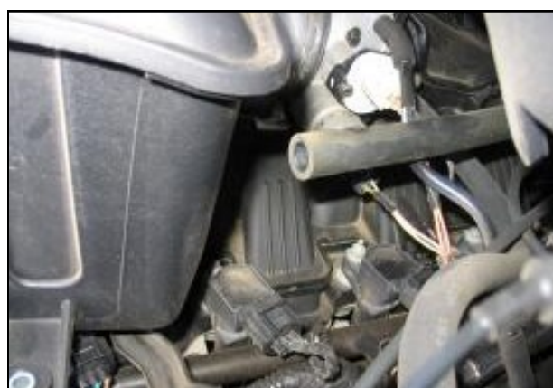
5. 2002 & 2003 Models Only: Disconnect the crankcase vent hose on the back of the factory throttle body air chamber.