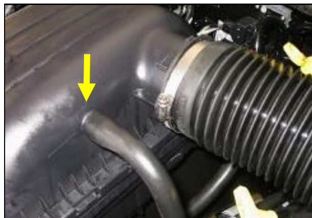
2. 2004-05 Models Only: Disconnect the factory breather hose from the factory air box lid.