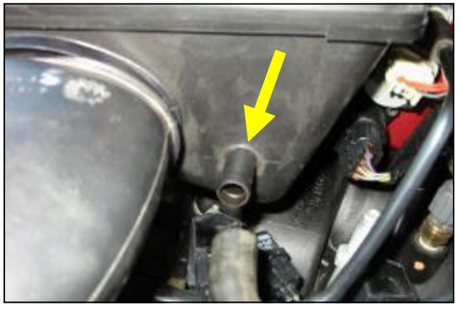
3. Disconnect the breather hose from the factory air box silencer.