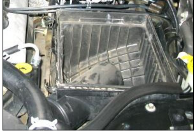
2. Remove the factory air filter box lid, accordion tube, and air filter. (Note: leave factory air filter base installed in vehicle)