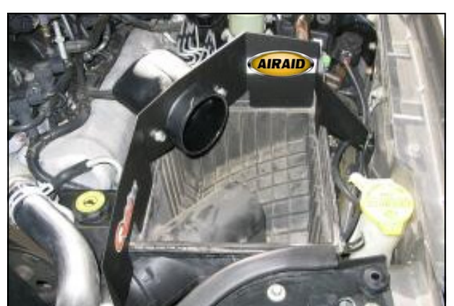
7. Position the Airaid Cool Air Dam in place of the factory air box and snap into place.