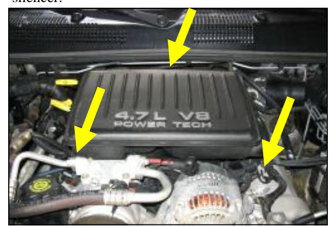
4. Loosen the hose clamp on the throttle body & both 10mm bolts securing factory air box silencer to intake manifold. Remove the factory air box silencer from engine compartment.