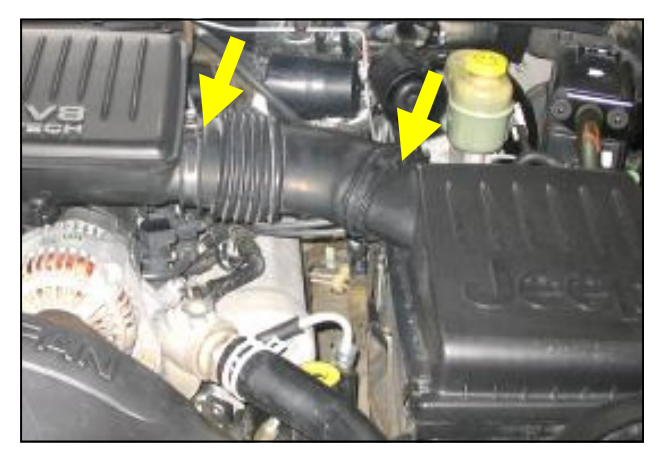
1. Disconnect the negative battery cable, and then loosen both of the hose clamps to factory tube connecting factory air filter assembly to factory air box silencer.