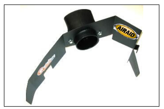
6. Using the two ¼-20 bolts and washers provided, fasten the black plastic filter adapter to the Airaid Cool Air Dam. Apply the Airaid Foil Decal onto the Panel as shown.