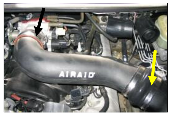
9. Position the Modular Intake Tube assembly to connect the reducer to the throttle body and the hump hose to the Airaid Cool Air Dam. (Note: leave the hose clamps loose until final assembly)