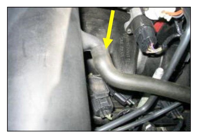
10. Connect the factory breather hose to the Modular Intake Tube & secure hose with the #16 black speed clamp provided.