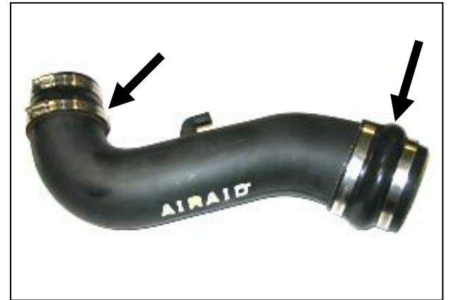
8. Slide the urethane hump hose and hose reducer onto the Modular Intake Tube. Use the two #60 hose clamps on the hump hose and a #56 & #52 hose clamp on the big & small ends of the reducer.