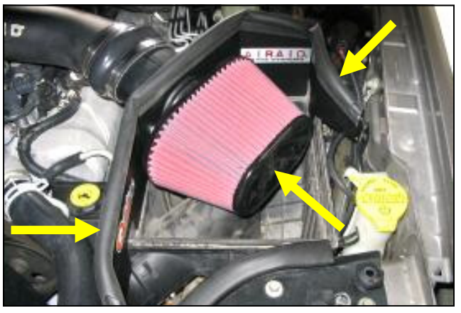
11. Mount the Airaid Premium filter & weather strip onto the Cool Air Dam. (Hint: start the weather strip at a corner and work towards the ends).

12. Double check your work to be certain that all nuts, bolts, and clamps are securely fastened.