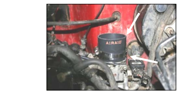
17. Install the reducer (#6) onto the throttle body using two #44 hose clamps (#16). Tighten only the hose clamp on the throttle body for now..