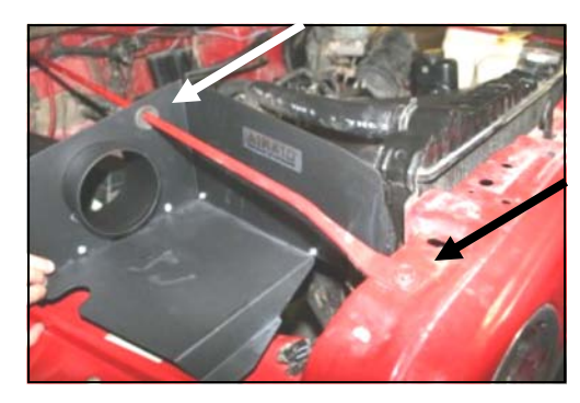
13. Align the CAD over the mounting holes, and re-install the factory bolt from step #10 in the radiator support. Slide the grommet forward into the hole in the CAD as shown.