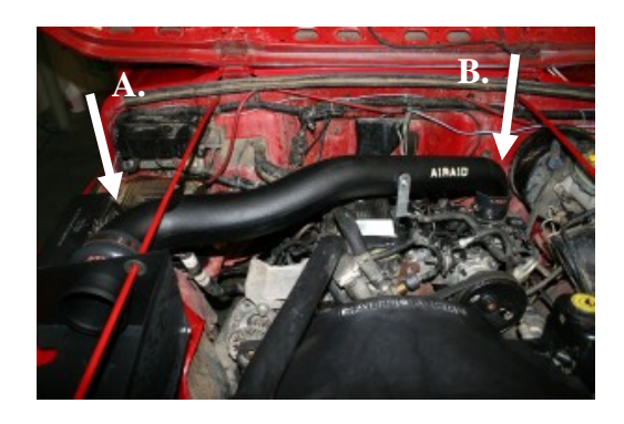
19. A.) Install the large end of the Airaid Intake Tube into the hump hose.B.) Now slide the small end into the reducer on the throttle body.