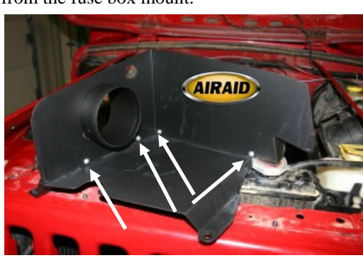
11. Assemble the two Cool Air Dam panels (#2) & (#3) using the four 6-32 screws (#8), #6 flat washers (#9), and nuts (#10). Apply the Airaid Foil Decal onto the Panel as shown.