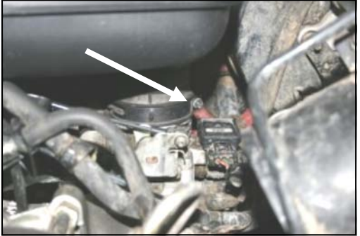
3. Loosen the clamp that holds the resonator to the throttle body.