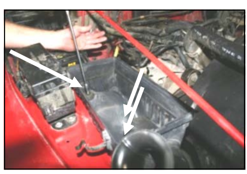
7. Remove three bolts from inside the lower air cleaner box and remove it from the vehicle.