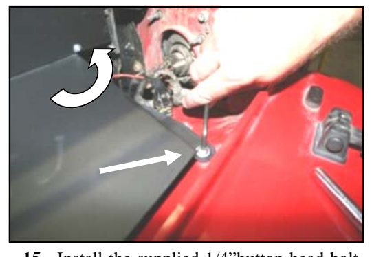
15. Install the supplied 1/4"button head bolt (#11), and 1/4" washer (#12), thru the CAD , with the 1/4" fender washer (#13) and nut (#14), on the bottom of the fender. Re-install the factory bolt in the radiator shroud removed in step #9.