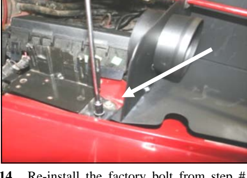
14. Re-install the factory bolt from step # 8 thru the CAD , and into the fender. Re-install the fuse box on the factory mount.