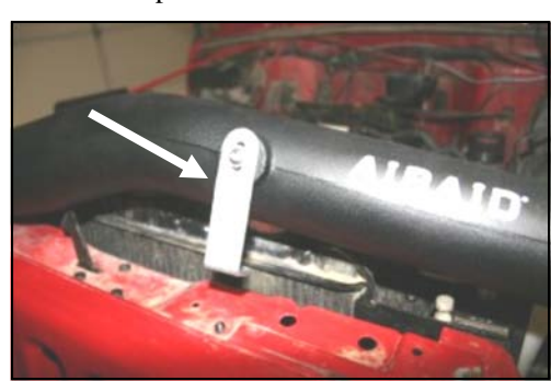
18. Install the L-bracket (#18), onto the Airaid Intake Tube (#4), using one 1/4" button head bolt (#11), and flat washer (#12). Leave the bolt loose for now.