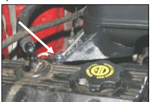
5. Remove the bolt that holds the resonator to the valve cover.