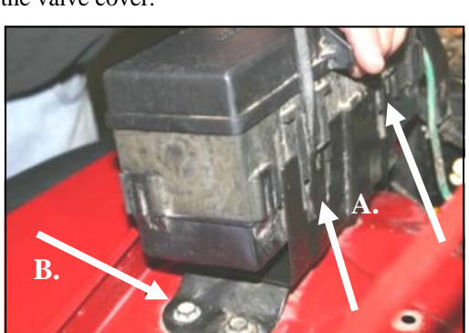
8. A.) On the right fender, pry two tabs away from the fuse box, lift it up and set it off to the side. B.) Next, remove and save the outside bolt from the fuse box mount.