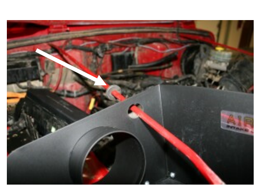
12. Slide the rubber grommet (#19) over the radiator support, followed by the assembled CAD. Use caution not to scratch the paint on the support rod.