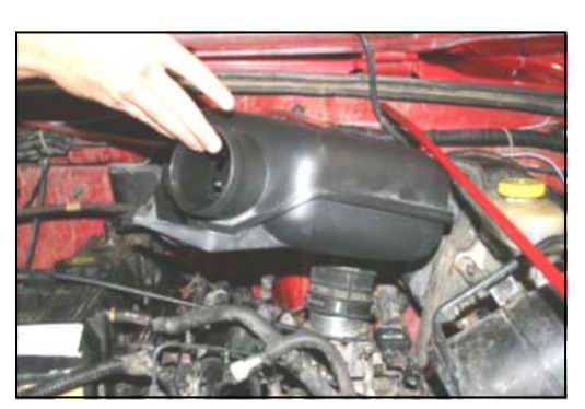
6. Remove the resonator from the vehicle.