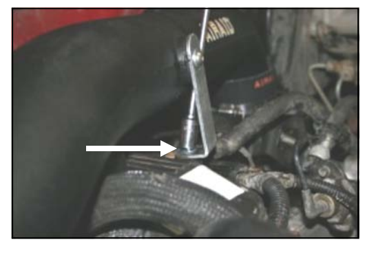
20. Install the 6mm bolt (#15), and 1/4" flat washer (#12), thru the L-bracket, and into the valve cover, adjust for fit, and then tighten all hose clamps, and bolts.