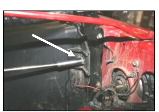
9. Remove one bolt from the passenger side radiator fan shroud and save it for step #15.