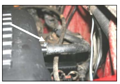
4. Disconnect the breather hose from the resonator.