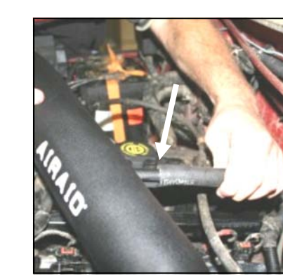
21. Re-connect the breather hose to the Airaid Intake Tube.