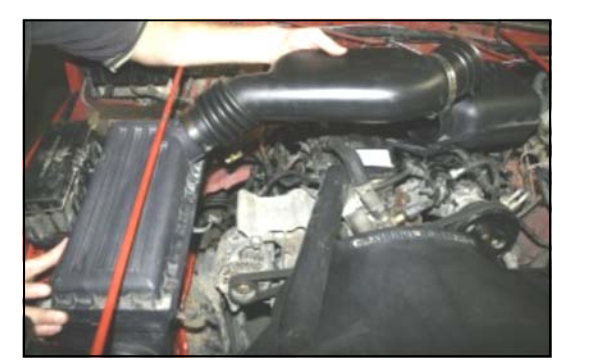
2. Unlatch the clips on the factory air cleaner lid, next remove the lid, and tube as an assembly.