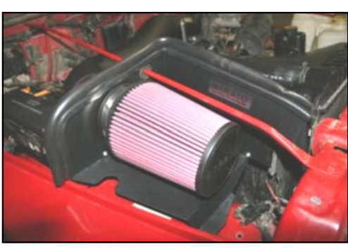
22. Install the Airaid Premium Filter (#1) onto the CAD tube and tighten the hose clamp. Next, install the weather strip onto the top of the CAD as shown, starting at the fender, working your way towards the radiator.