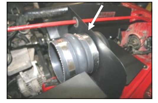
16. Install the hump hose (#5) onto the back side of the CAD tube using two #72 hose clamps (#17). Tighten <u>only</u> the hose clamp on the metal tube for now.