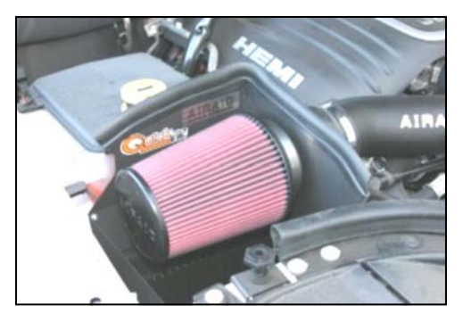
19. Install the Airaid Premium Filter (#1) on the Quick Fit assembly as shown, and tighten the hose clamp.