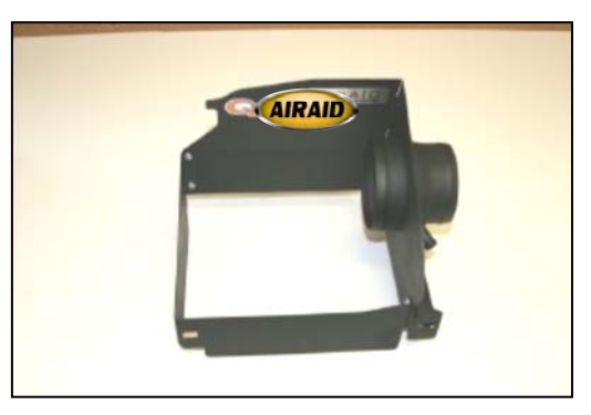
11. Assemble the two pieces of the Quick Fit panels as shown (#2&#3), using the four 6-32 screws (#12), washers (#13), and nuts (#14), that are provided in the kit. Apply the Airaid Foil Decal onto the Panel as shown.

8. Carefully pull the resonator towards you and rotate the bottom up to gain access to the tie wrap holding the breather hose to the rubber coupler. Cut the tie wrap and discard.