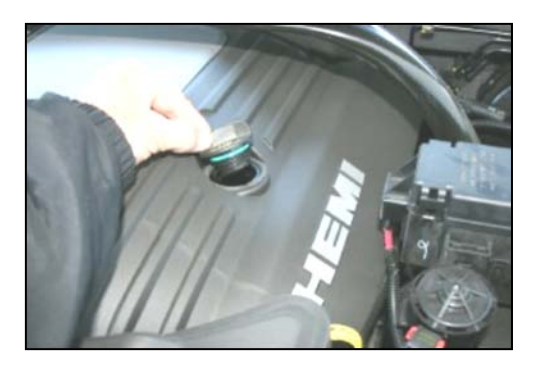
21. Re-install the oil fill plug.

18. Carefully install the end of the Airaid Intake Tube (#4) into the hump hose, and then into the reducer on the throttle body as shown. Adjust the tube as needed, and then tighten the four hose clamps.