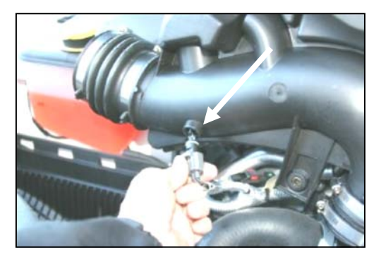
10. Carefully twist and remove the temperature sensor from the bottom of the resonator, and then remove the resonator from the vehicle.

7. A.) Loosen the hose clamp on the throttle body. B.) With a 10mm socket, remove the bolt next to the throttle body that holds the intake resonator in place.