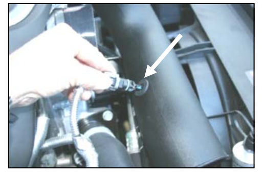
17. Carefully install the factory temperature sensor into the grommet. Make sure it is seated all the way in.

14. Install the hump hose (#5) and two #60 hose clamps (#10) on the Quick Fit assembly.Do not tighten the clamps at this time.