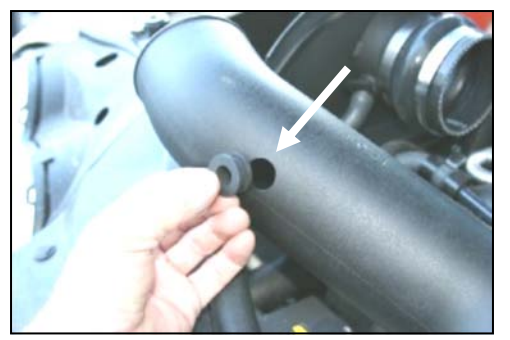
16. Install the supplied grommet (#8) into the hole in the back of the tube.

13. Install the Quick Fit assembly in the bottom of the stock air box by sliding the four tabs on the back into the slots on the airbox, once installed, re-hook the two latches. Next, install the speed clamp (#10) over the breather hose and connect it to the Quick Fit assembly as shown.