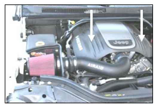
20. Re-align the engine cover with the grommets on the engine, and push down firmly to re-seat the cover.