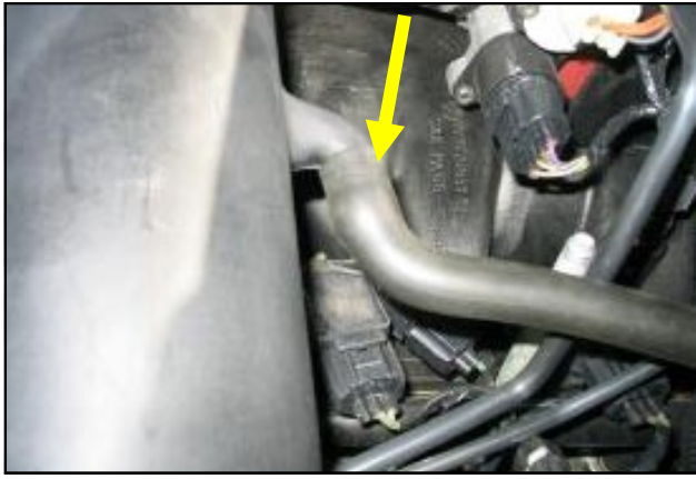
10. Connect the factory breather hose to the Modular Intake Tube & secure hose with the #16 black speed clamp provided.