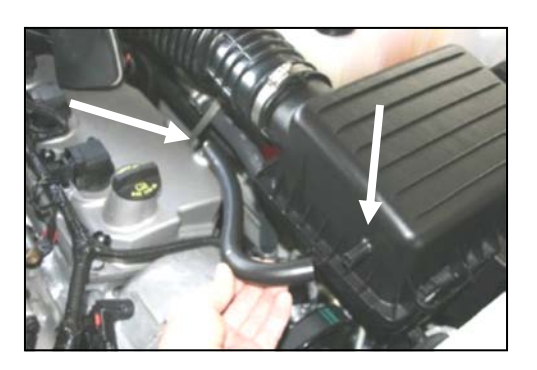
Disconnect the negative battery cable. Remove the breather hose from the factory air box lid and valve cover. 2.7L Engines: remove the hard plastic breather tube at the elbow near the back of the valve cover.

Full color instructions can be viewed on our web site at Airaid.com. If you need <u>any</u> assistance please call 1-800-858-3333 to speak with a representative in our Customer Service Center before returning the product.