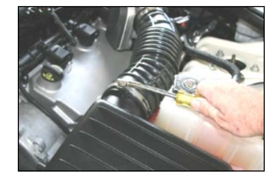
2. Loosen the hose clamp on the factory intake tube, located at the air box lid.