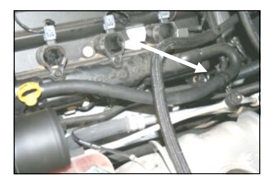
10. For 2.7L Engines : After installing the Quick Fit Panels, ( Refer to step # 7), connect the breather hose to the factory elbow at the back of the valve cover using one #16 speed clamp. (Factory intake tube removed for instruction purposes).