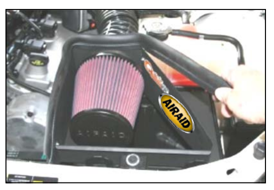
12. Install the weather strip (#4) on the top of the Quick Fit panels. ( Hint: Start at one end and work all the way to the other end ).