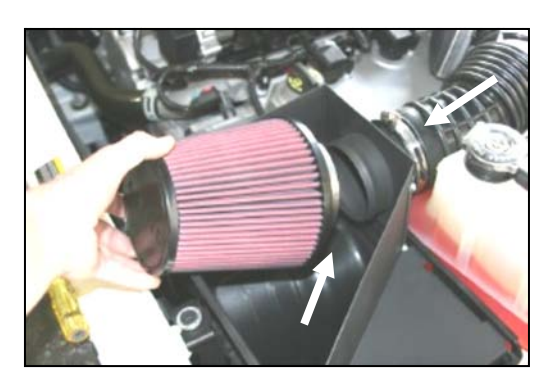
11. Slide the Airaid Premium Filter (#1) onto the Quick Fit panel tube, and tighten the hose clamp. Install the factory intake tube onto the opposite end of the Quick Fit panel tube, and tighten the hose clamp. Tighten the speed clamps on the breather hose, and the 1/2" rubber elbow.