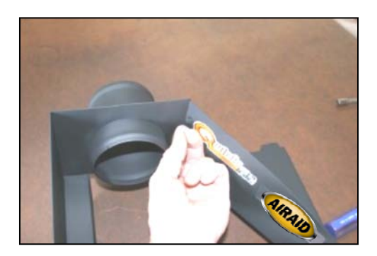
5. Assemble the Quick Fit panels (#2, #3) using four 6-32x 5/16" screws