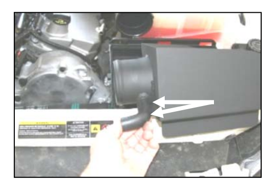
6. Slide the 1/2" rubber elbow (#8) onto the breather fitting on the side of the