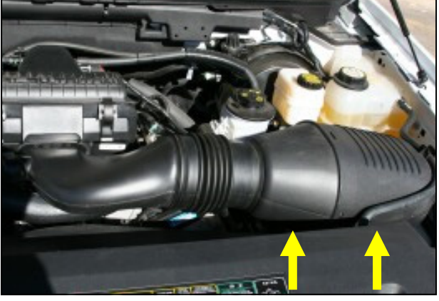
2. Grasp large oval section of intake tube and pull up and away from inner fender well, and remove entire intake tube. ( Note: Intake tube is held in with rubber grommets, no bolts. )

3. Remove 13mm nut on power steering reservoir bracket. Install Airaid M odular I ntake T ube support bracket, replace nut, and leave slightly loose. ( Nut will be tightened after final adjustments. )