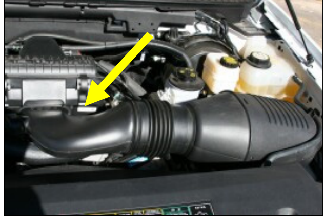
1.Disconnect The Negative Battery Terminal! Disconnect intake tube from air filter housing by unsnapping the tube assembly from the housing.