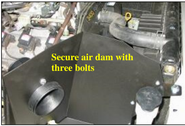
Secure air dam with three bolts

10. Position the Airaid intake assembly in place of the original, factory assembly. Using three supplied 8mm bolts and washers, mount the Airaid assembly using the three original/factory mounting points.