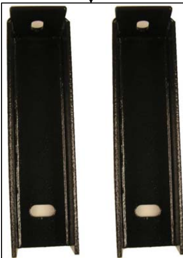
Passenger/Driver Rear Mounting Brackets