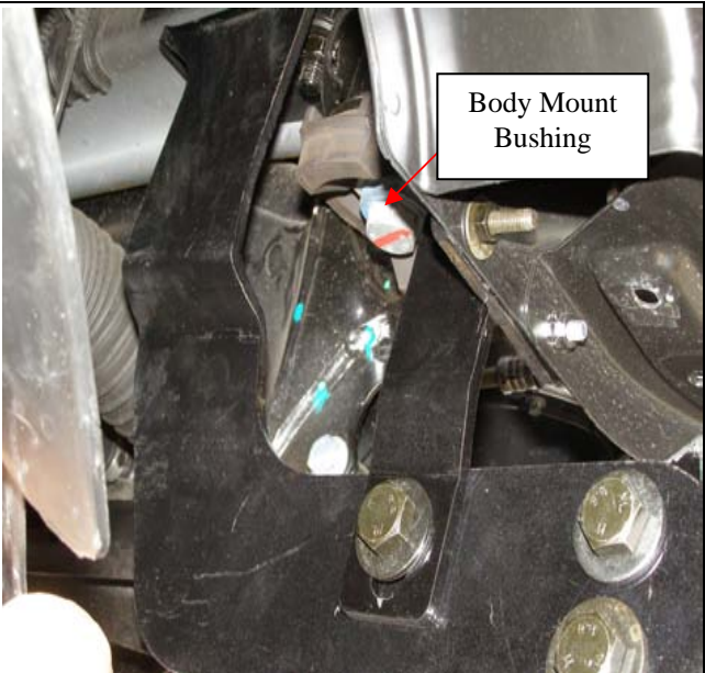
Body Mount Bushing