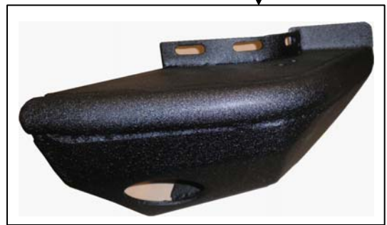
Passenger/Right Side Corner