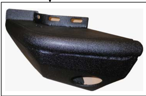
Driver/Left Side Corner