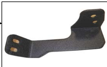
Passenger/Right Side Bumper corner Bracket