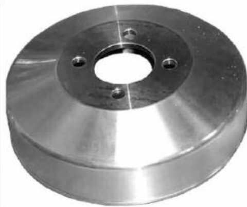
Water Pump Pulley # MAS176