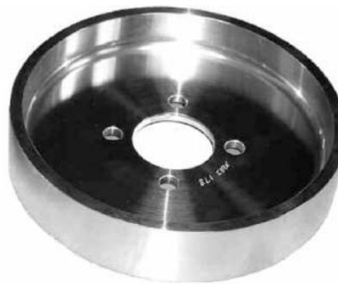
Water Pump Pulley # MAS178