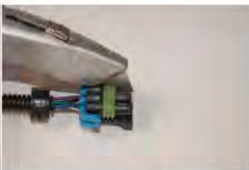
Using a sharp knife