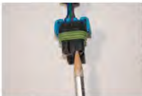
Open this slot up

On the male connector of the provided extension wires, the plastic needs to be trimmed out of the other slot as shown in the pictures. Use a sharp knife to carefully trim out the plastic to open the slot. Also make this modification to the O2 sensor plug.