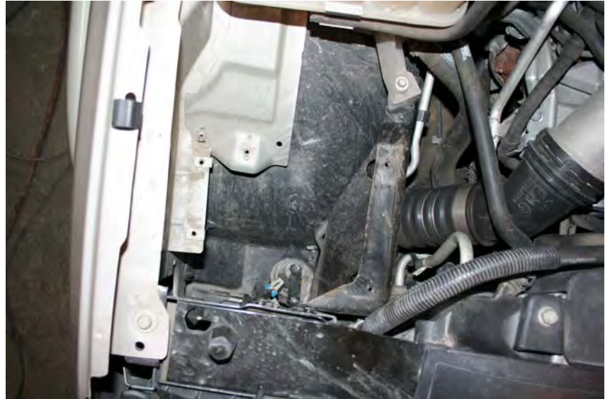
Picture shown without air filter box