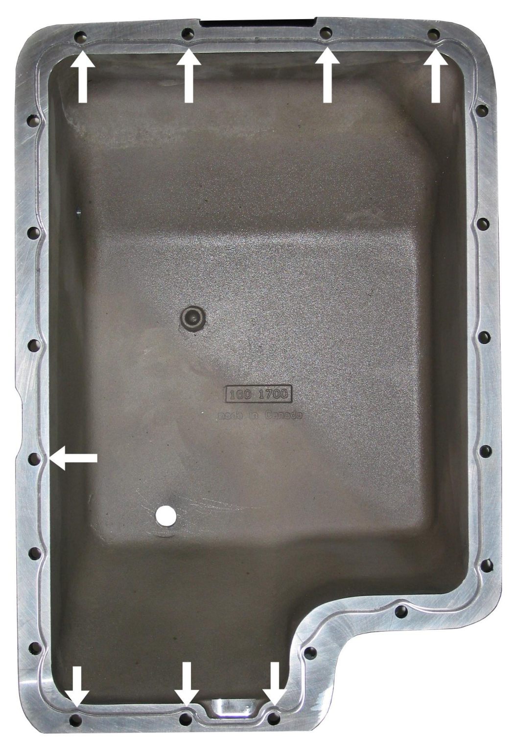
NOTE: Use a torque wrench when installing any transmission component.

PLEASE NOTE: There are 8 short bolts (8mm X 25) in this kit, they should be installed in the hole locations marked (see picture below) or damage may result.