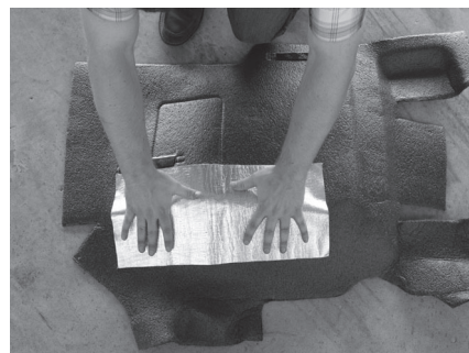
FIGURE 2: DRIVERS SIDE

IMPORTANT: Jeep floor should be at least 68°F (20°C) for maximum adhesion. Clean all areas with rubbing alcohol before applying tape. When removing backing, do not touch adhesive. If both front and rear kits were purchased be sure to install the rear cargo area first.