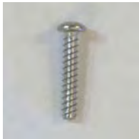
Plastite Screw (4 per)