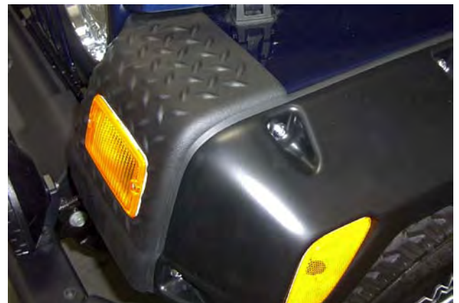
Photo #4 – Front Corner edge is under new Bushwacker Wiper-Style Edge Trim