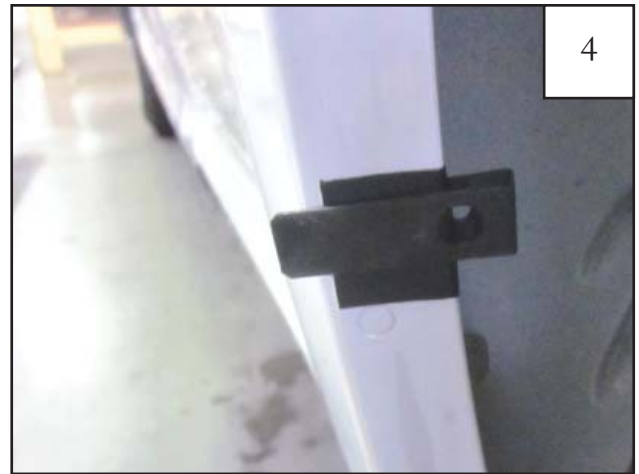
Install a Clip (CL1-0009) over the Tab (MT1-0034) placed in Step 3.