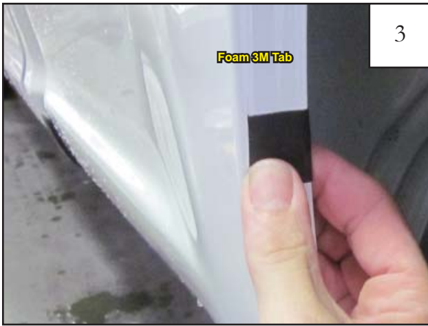
Wrap a Foam Tab (MT1-0034) around the wheel well sheet metal, centered over the mark made in Step 2.