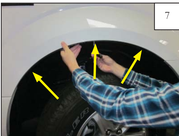
Using a 7/32" socket wrench, reinstall the factory screws through the inner piece.