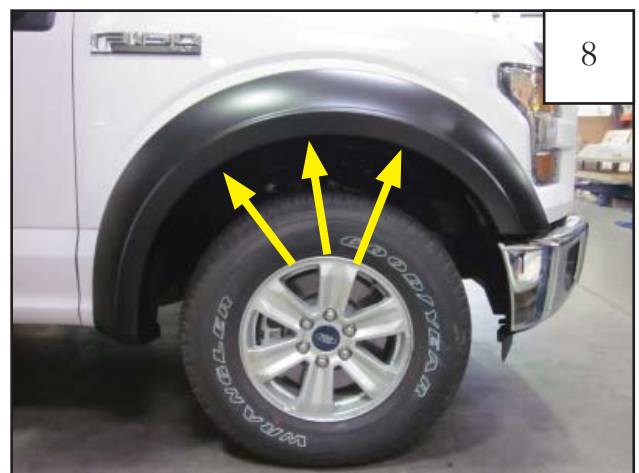
Position flare on fender, pressing inward on the flare, line up the flare mounting holes with the mounting clips on the inner piece. Install 3 Phillips Truss Screws (SW1-0058) through the flare and into the clips on the inner piece. Do not tighten. (3 locations)