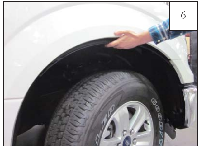
Line up the holes in the inner piece with the three uppermost factory holes. NOTE: Driver's side inner piece is marked with an "LR" and passenger's side inner piece is marked with an "RR".