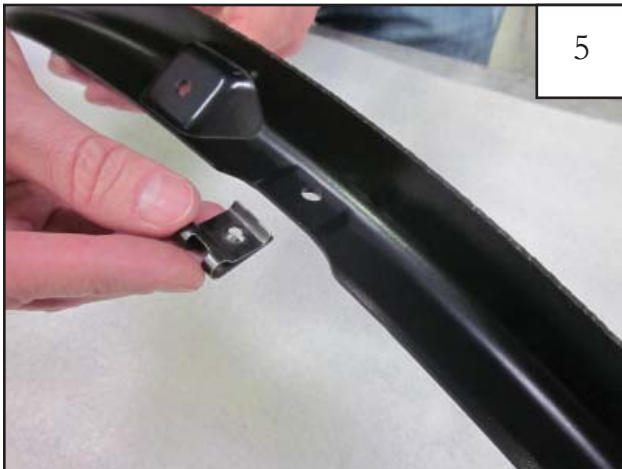
Attach 3 "U"clips (CL1-0022) to the inner bracket as shown.