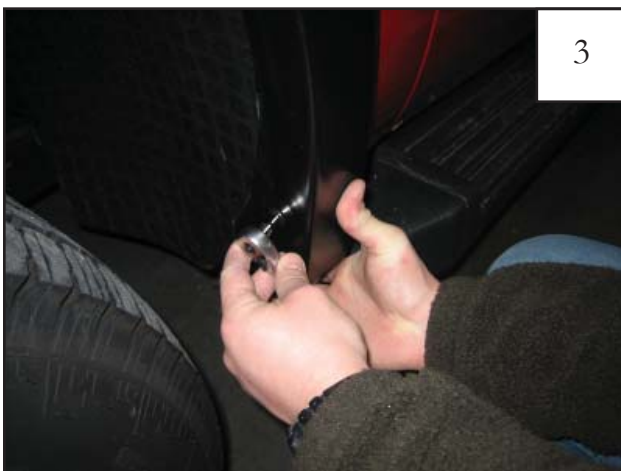
Position flare on fender, and reinstall four factory screws removed in Step 1.