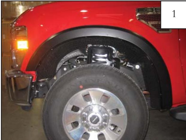
Using a 7/32" socket, remove four factory screws. Retain screws for later use.