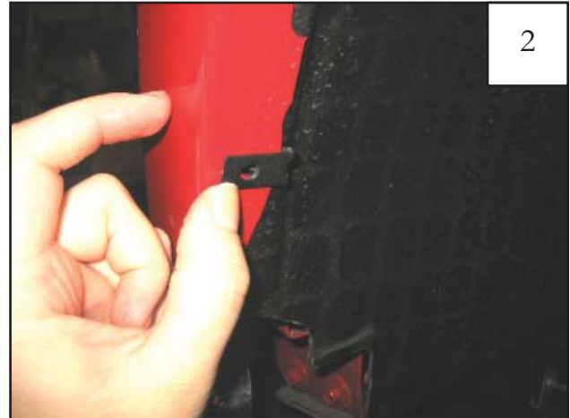
Slide a supplied U Clip over factory hole located at lower front of wheel well.