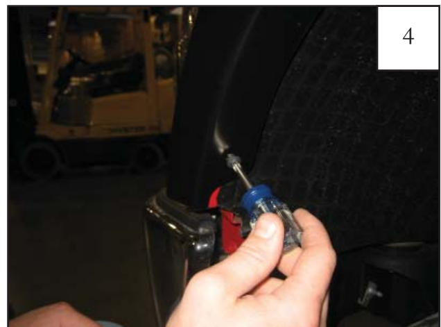
Install a supplied Pan Head Screw through forward hole in flare and into clip installed in Step 2.