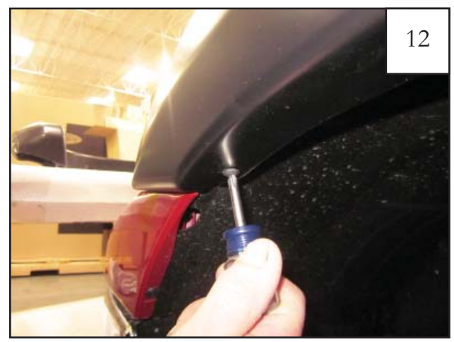
Align holes in flare with holes in Clips (CL1-0005). Start a supplied Screw (SW1-0050) through holes in flare and into each Clip (CL1-0005) installed in Step 11 in the order shown in Step 13. If necessary, use an awl to locate holes in clips.