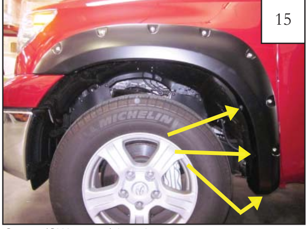
Screw (SW1-0036) locations.