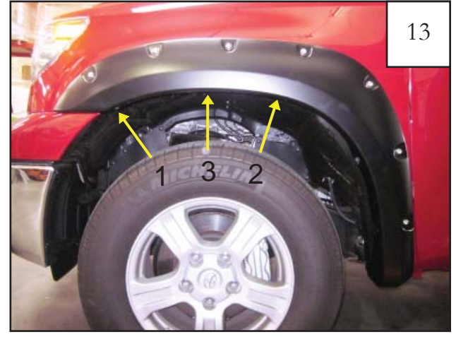
Start Screw (SW1-0050) in location #1 first, then move to #2, and start in location #3 last.