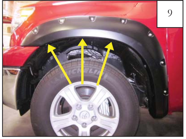
Three marked Clip (CL1-0005) locations.