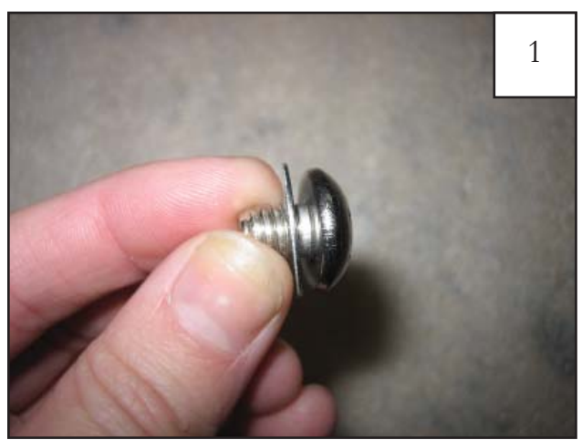
Put a Washer (WA1-0012) on each Bolt (SW1-0059).