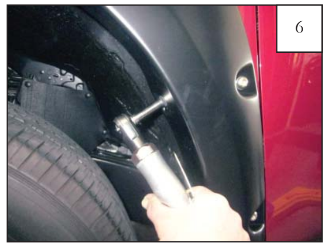
Start supplied Screw (SW1-0036) through top rear hole in flare and into factory hole in rear of wheel well. Do not tighten.