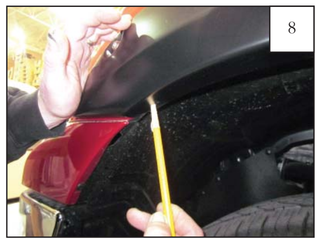
Hold front of the flare firmly on the fender. Mark three Clip (CL1-0005) locations using the holes in the flare as a guide.