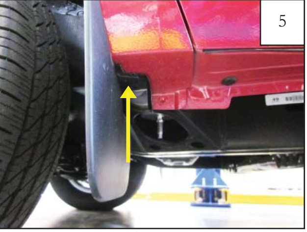
Remove one hex bolt from underside of mud flap using a 10mm socket. Discard mud flap