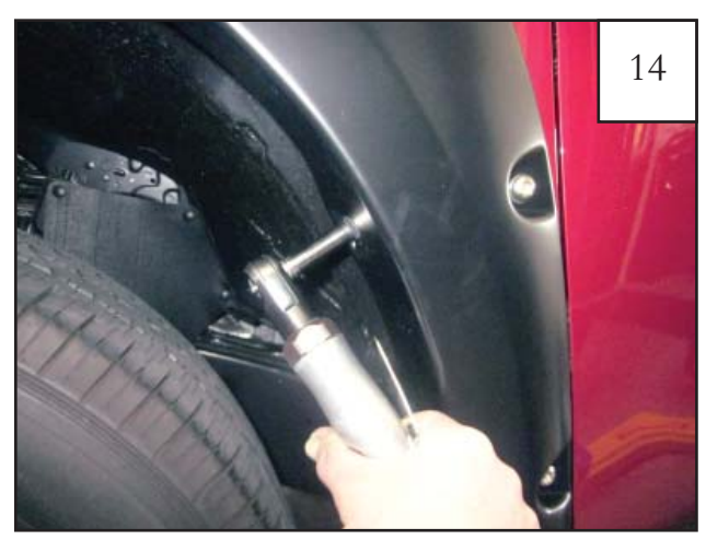
Start Screw (SW1-0036) through the three lower rear holes in flare and into factory holes in rear of wheel well.