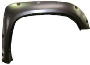
Driver Side x1