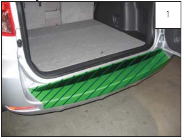
Open rear door of vehicle. Make sure that all installation surfaces are free of dirt and/or grease. Use a clean, lint-free cloth and isopropyl alcohol based cleaner.