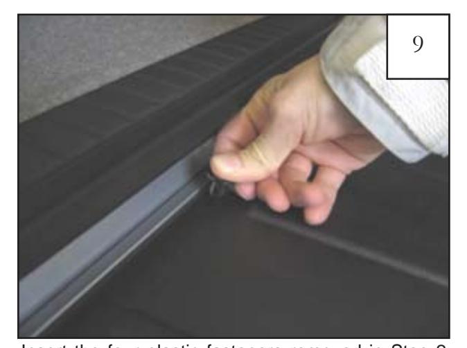
Insert the four plastic fasteners removed in Step 2 through the holes in the bumper protector and into the holes in the bumper threshold. Press into place.