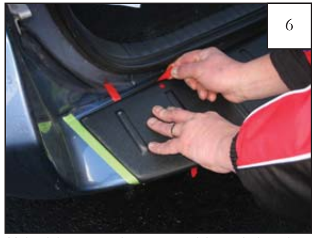
Maintaining part placement, stick peeled end to bumper and begin pulling center tab while applying downward pressure to center tape pad. Repeat for liner nearest the front of the vehicle. Repeat for liner toward the rear of the vehicle.