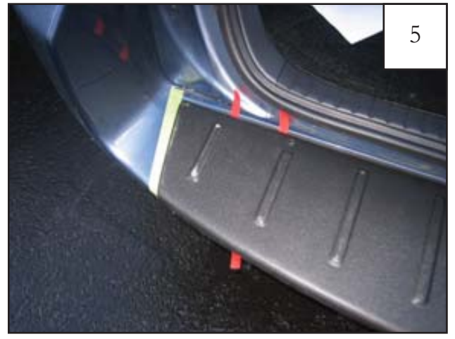
Hold the part at an angle to prevent tape from prematurely sticking and align on the bumper by aligning holes in part with factory holes in bumper and using the masking tape applied in Step 4 as a guide.