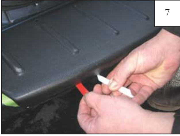
When peeling liner along front edge of part, run edge trim tool along under part in front of liner to create a small gap for ease of liner removal.