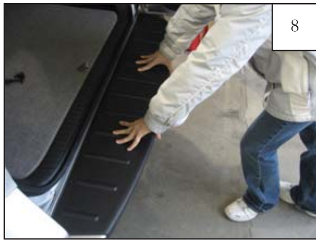
Press the part into place starting at the left side, pushing downward and forward while working your way to the right. Apply 30 PSI to the taped areas for proper bond. Tape reached maximum adhesive bond after 24 hours of contact.