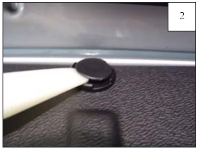
Using a nylon tool, remove the four factory plastic fasteners in the bumper threshold. Retain these fasteners for later use.