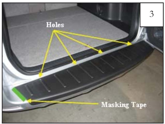
WITHOUT peeling liner from tape pads, align part on bumper, matching up the holes in the bumper protector with the factory holes in the bumper. Apply a piece of masking tape along both edges of part for ease of placement during installation.