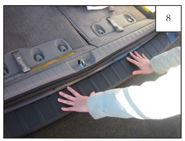
Press the part into place starting at the left side, pushing downward and forward while working your way to the right. Apply 30 PSI to the taped areas for proper bond. Tape reached maximum adhesive bond after 24 hours of contact.