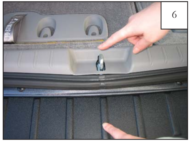
Hold the part at an angle to prevent tape from prematurely sticking, and align the part on the bumper by aligning center rib in part with metal loop on striker and using the masking tape applied in Step 2 as a guide.