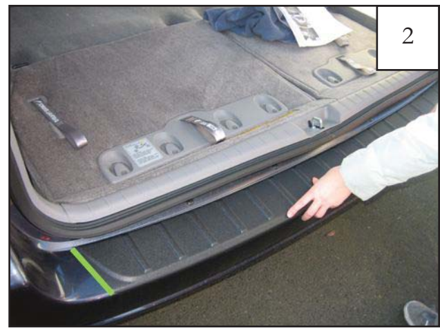
Apply a piece of masking tape along both edges of part for ease of placement during installation.