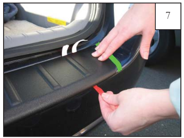
Maintaining part placement, stick peeled end to bumper and pull tab nearest the rear of the vehicle while applying downward pressure to rear edge of part. Repeat process for liner for center tape, then liner towards the front of the vehicle.