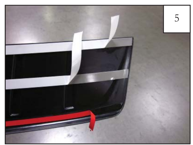
Peel red liner partially from tape pads. NOTE: Make sure tabs are folded toward the outside of the part and that the middle tape liner is in front of rear liner.