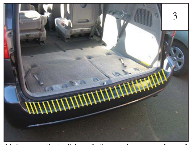
Make sure that all installation surfaces are free of dirt and/or grease. Use a clean, lint-free cloth and isopropyl alcohol-based cleaner.