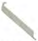
ET1-0002, Edge Trim Tool, 1 PC.