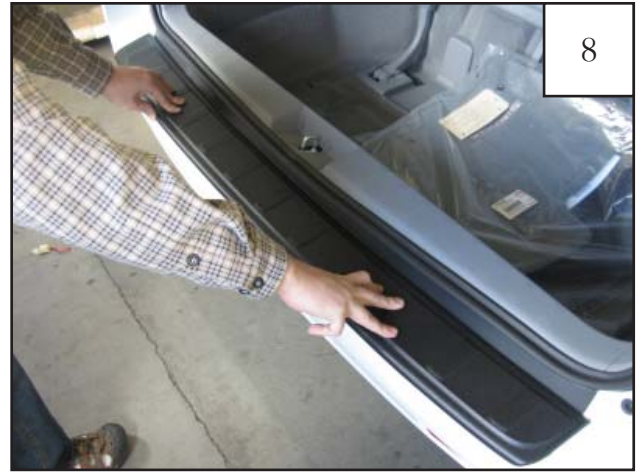
Press the part into place starting at the left side, pushing downward and forward while working your way to the right. Apply 30 PSI to the taped areas for proper bond. Tape reaches maximum adhesive bond after 24 hours of contact.