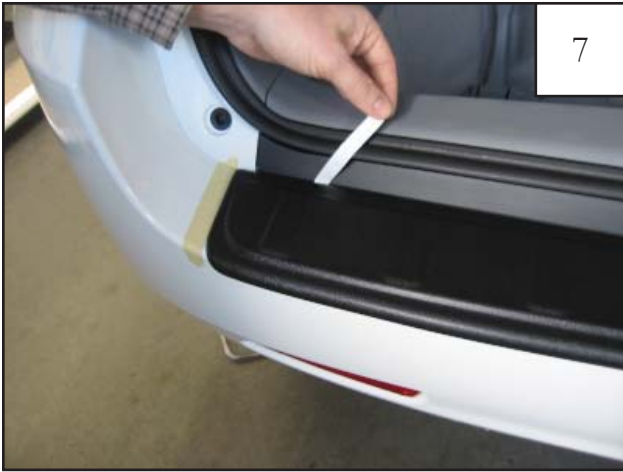
Maintaining part placement, repeat process for final white tab liner.