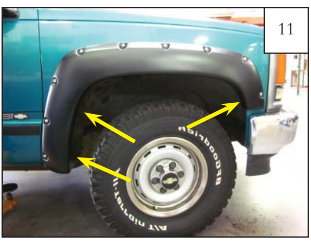
Start supplied screw (SW1-0050) through each of the remaining holes.