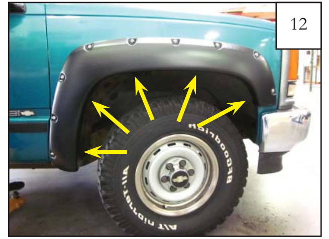
Applying moderate pressure to outside surface of flare, tighten all screws beginning with the two top locations and then the remaining screws.