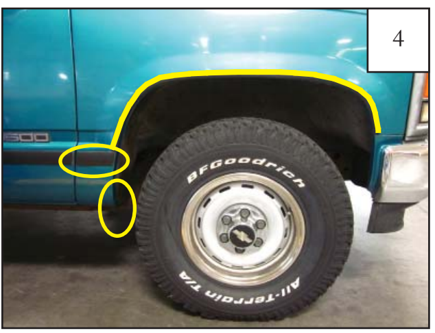
Remove factory fender trim, front fender body side molding and mud flaps (when installed).