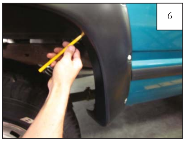
Hold flare in position on fender using moderate pressure. Using a grease pencil, mark five hole locations using the holes in the flare as a guide. (See Step 7)