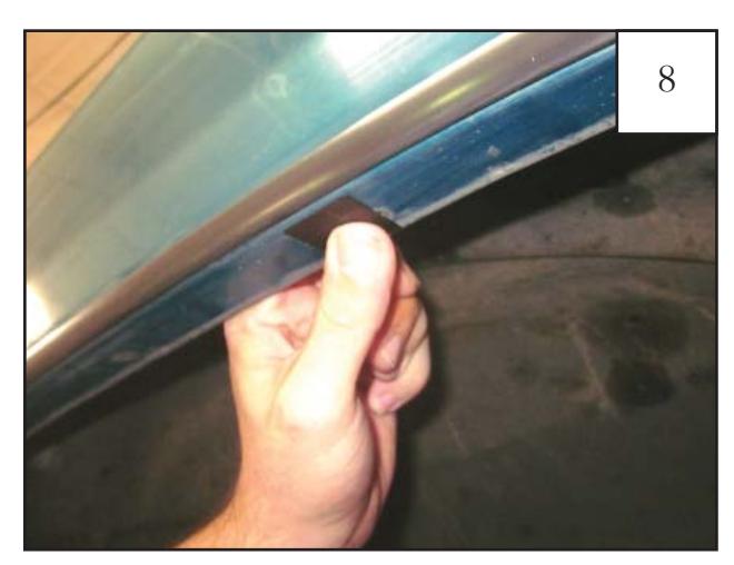
Remove flare. Center a supplied Tab (MT1-0002) over the marks made in Step 6, aligning edge of tab with inside edge of fender lip (tab may extend over outside of fender).