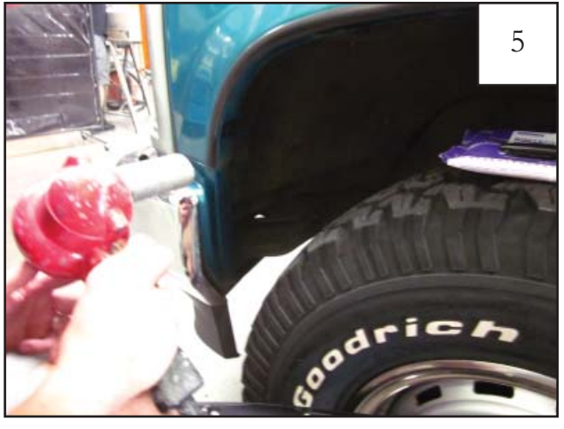
Use hair dryer or heat gun to heat molding. This helps loosen the adhesive making it easier to remove.