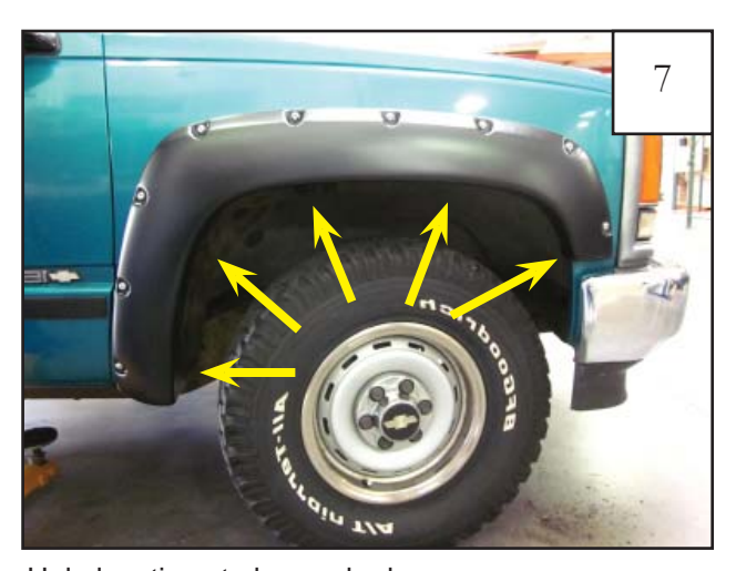
Hole locations to be marked.