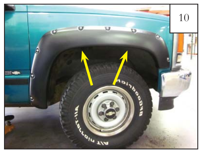
Reposition flare on fender. Start supplied screws (SW1-0050) through upper two hole locations and through each Clip (CL1-0005) installed in step 9. If needed, use awl to align holes with the installed clips.