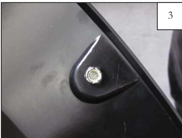
Place a Nut (NU1-0019) over the end of each Bolt and tighten, using a 1/2" wrench for the Nut and the supplied Torx Bit (SW1-0052) for the Bolt. Repeat for remaining pockets.