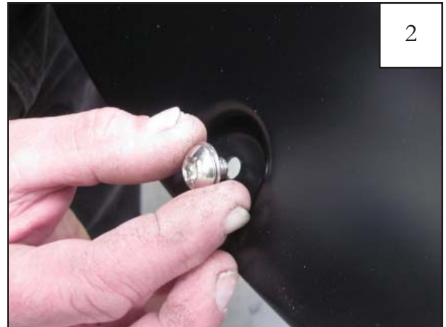
Put each Bolt/Washer combination through a pocket hole in the flare, Bolt head and Washer on the outside.