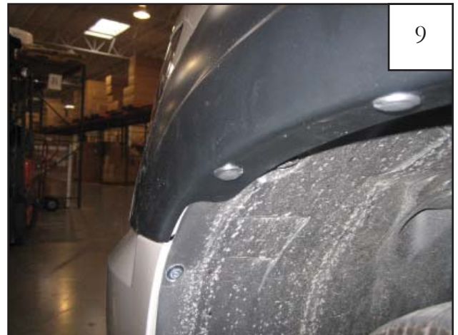
Using hole located in forward portion of flare as a guide, drill through the splash shield with a 5/16" bit. Holes in flare and splash shield should align with factory hole located in fender.