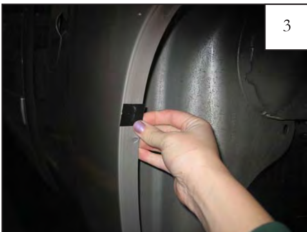
Center a supplied black plastic tab over each mark made in Step 3, aligning edge of tab with inside of fender lip (tab may extend over outside of fender).