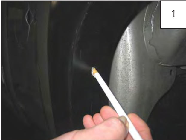
Holding flare in position on fender, use a grease pencil to mark six hole locations.