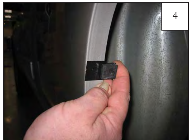
Slide a supplied clip over each black tab. Clips may need to be adjusted to align with holes in flare.