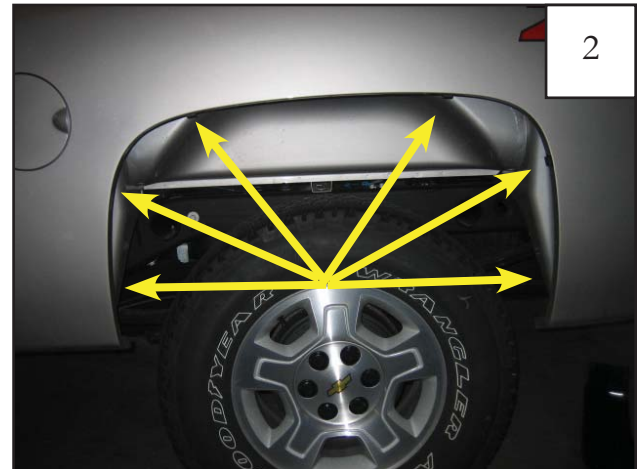
2 Six hole locations.