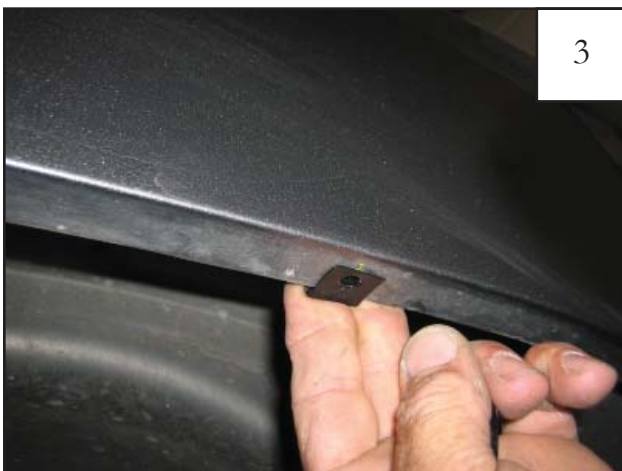
3 Slide a supplied Plastic Clip over two top marks made in Step 1. Clips may need to be adjusted to align with holes in flare. NOTE: the raised collar on the clip should face upward into the interior of the fender.