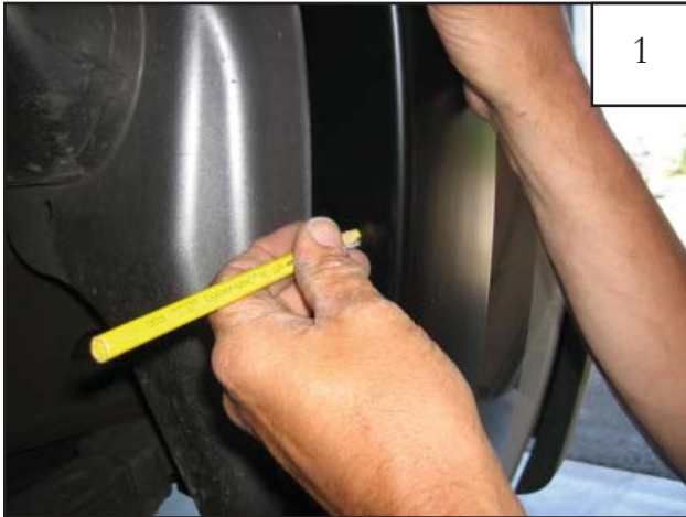
1 Holding flare in position on fender, use a grease pencil to mark six hole locations.