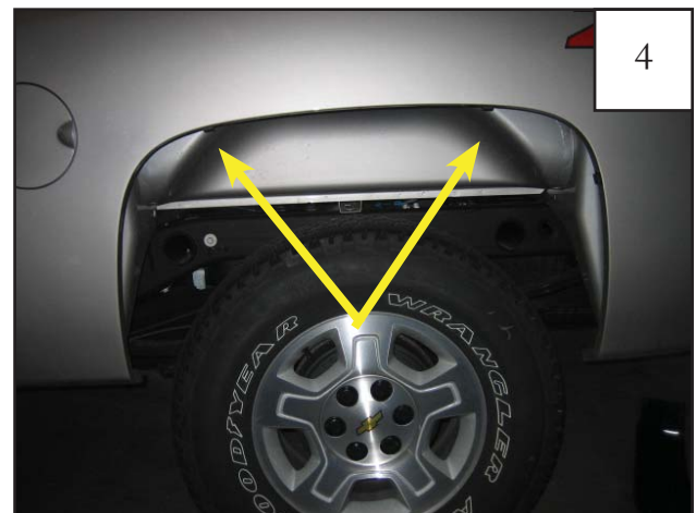
4 Plastic Clip locations.