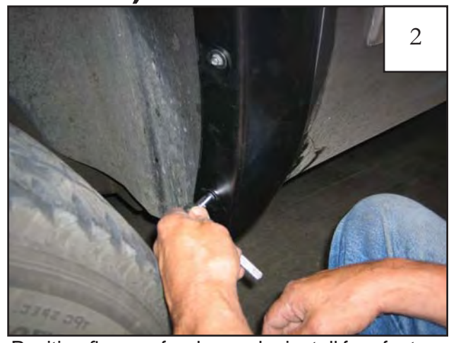
Position flare on fender, and reinstall four factory screws removed in Step 1. If needed, use an awl to locate holes.