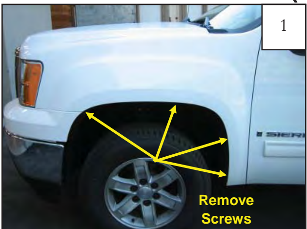
Using a 7mm socket, remove four factory screws. Retain screws for later use.