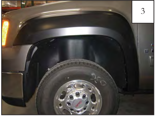
Verify fit and tighten all screws.