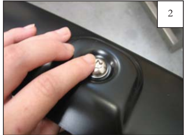
Put each Bolt through a pocket hole in the flare, bolt head on the outside.