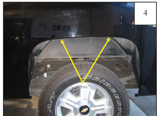
Plastic Clip locations.