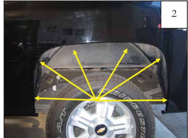
Six hole locations.