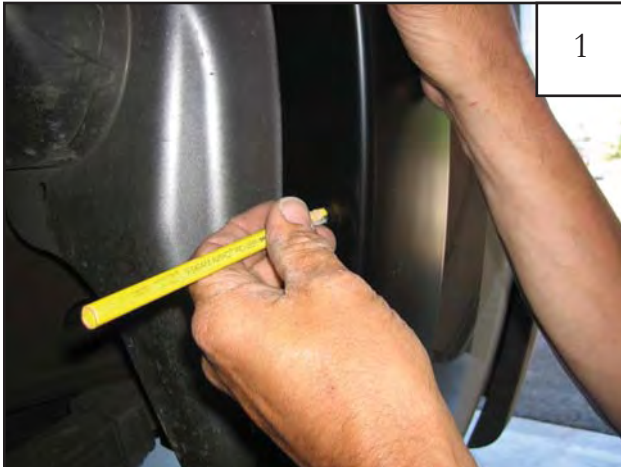
Holding flare in position on fender, use a grease pencil to mark six hole locations.