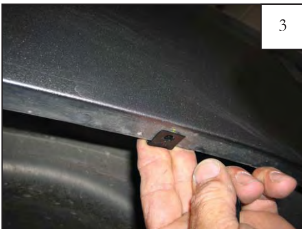
Slide a supplied Plastic Clip over two top marks made in Step 1. Clips may need to be adjusted to align with holes in flare. NOTE: the raised collar on the clip should face upward into the interior of the fender.