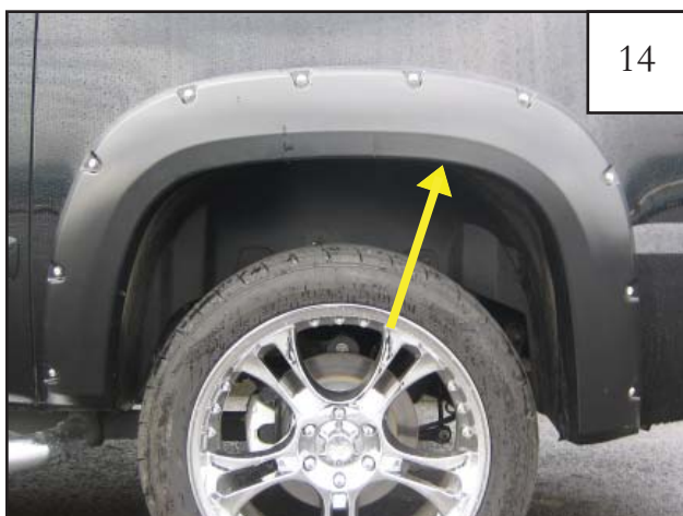
Install one supplied Retainer (RV1-P006) through rear corner hole in flare and into fender.