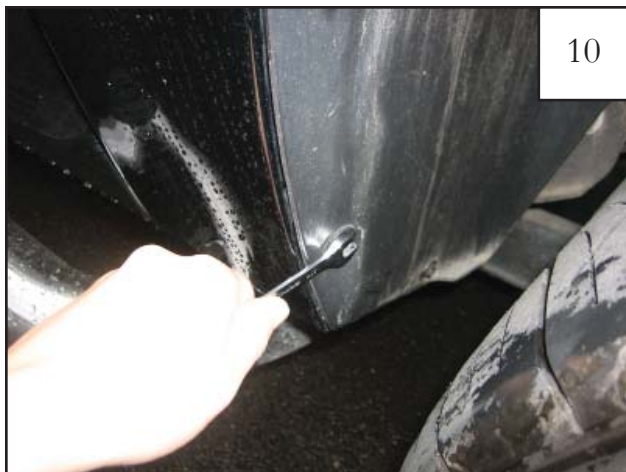
Using a 7mm socket, remove six factory screws. Retain screws for later use.