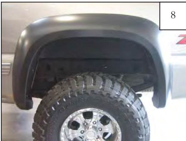
Completed rear flare installation.