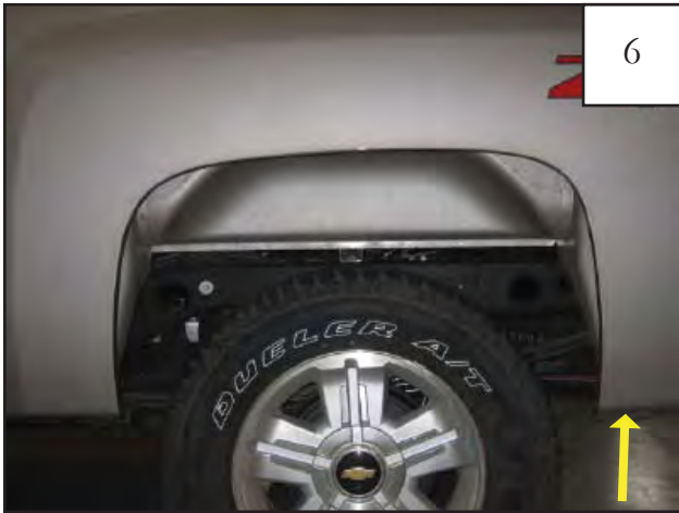
Remove one factory bolt with a 1/2" wrench.