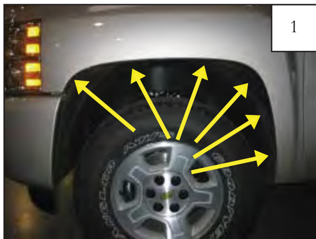
Remove six factory fasteners with a pry tool.