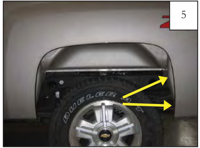
Remove two factory screws with a #2 stubby screwdriver.