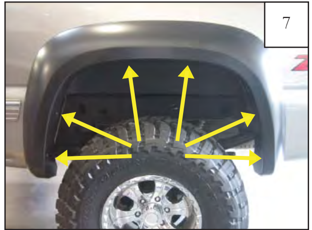
Install six tuflocks using a #2 stubby screwdriver.