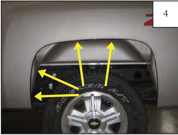
Remove four factory fasteners with a pry tool.