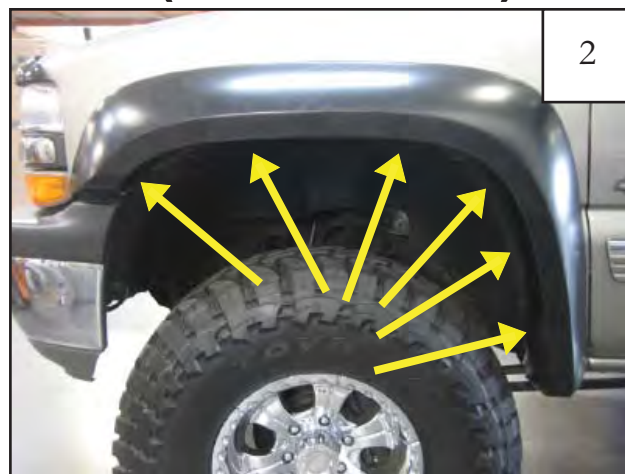
Install six tuflocks using a #2 stubby screwdriver.