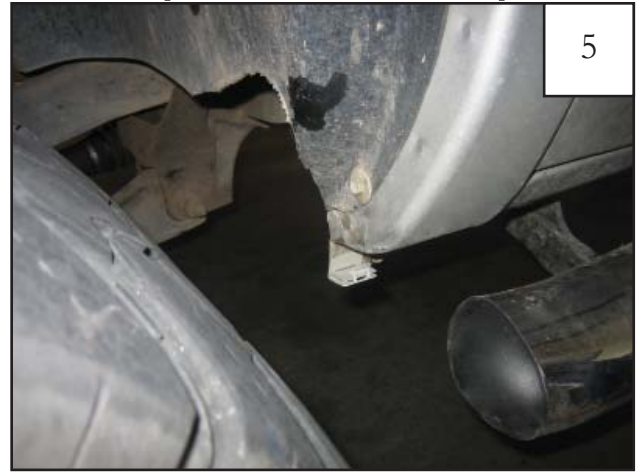
Install assembled Clip (CL1-0008 & CL1-0010) onto rear edge of front fender, aligning clip with edge of fender as shown. The snap lock feature of the Clip should be facing outward.