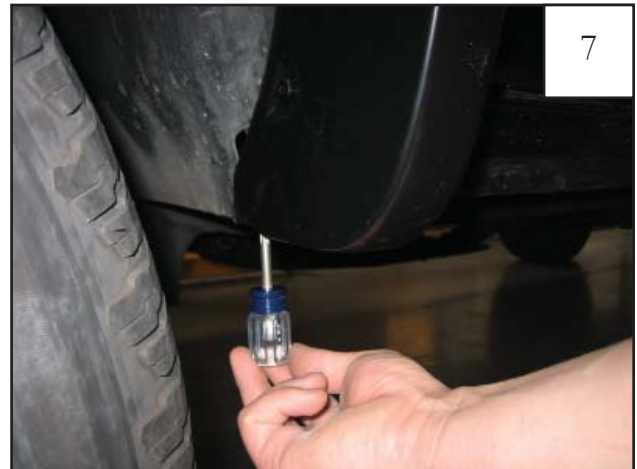
Using a Phillips screwdriver, install a supplied Screw (SW1-0049) into Clip (CL1-0008 & CL1-0010) installed in Step 5.