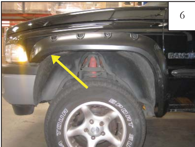
Position flare on fender, pushing flare tightly against fender. Using a right-angle drill with a #2 Phillips bit, drill one supplied Screw (SW1-0066) through plastic of fender flare and into sheet metal of fender using the indents in the flare as a guide.