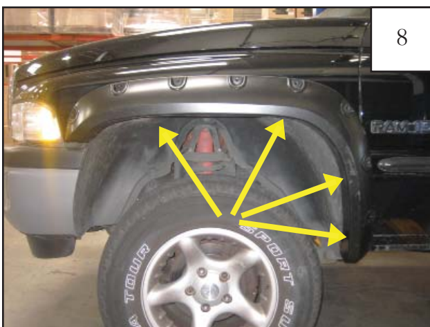
Using a right-angle drill with a #2 Phillips bit, drill four supplied Screws (SW1-0066) through plastic of fender flare and into sheet metal of fender using the indents in the flare as a guide. Install Screws from front to back.

NOTE: Flare will overlap front door when properly positioned. This overlap does NOT interfere with either flare fit or door operation. Door hinge points are located well back of the front seam and the flare's rear perimeter. The door surface moves in and away from the flare upon opening.