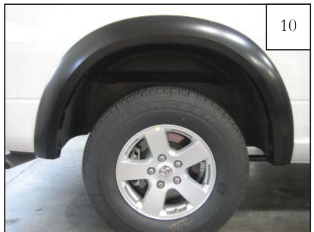
Press firmly on flare and tighten all screws. Installation Complete.