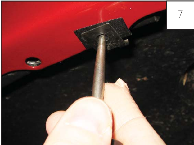
Using an awl or similar pointed tool, poke a hole through plastic tab using the speed clip hole as a guide.