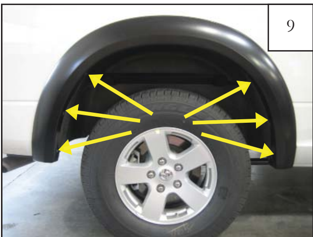
Hold flare in place while you start six additional supplied screws using a Phillips Head Screwdriver. Do not tighten.