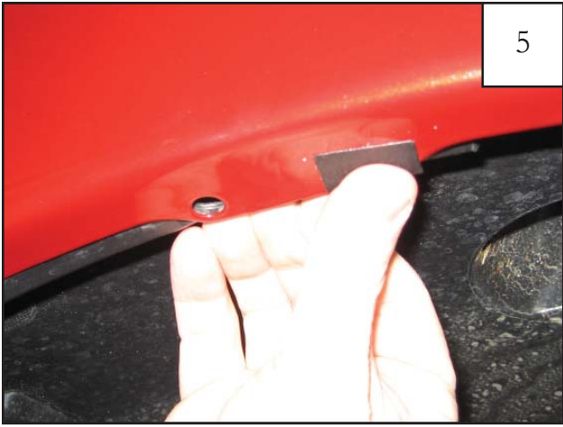
Install plastic tab over existing factory hole.