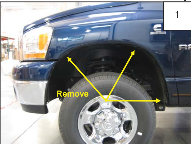
Using an 8mm socket, remove three factory screws from wheel well. Retain for future use.