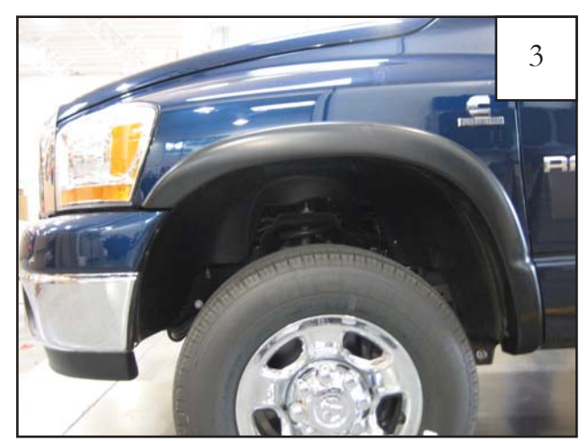
Make sure flare is correctly positioned on vehicle. Tighten all screws.