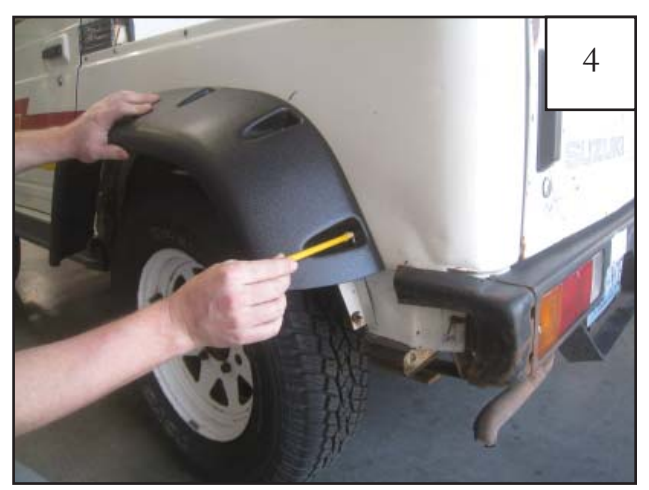
Hold rear flare in position on fender and, using a grease pencil, mark each hole location on sheet metal.