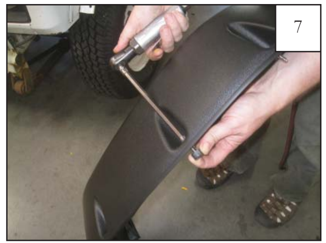
At each flare pocket, insert a Screw (SW1-0045) and run it into a Spacer (SP1-0009) until snug with the flare plastic. Use a 5/16" socket and 6" extension to prevent marring flare plastic. Wrap a layer of masking tape around Torx Bit (SW1-0052) to help it stay in the socket.