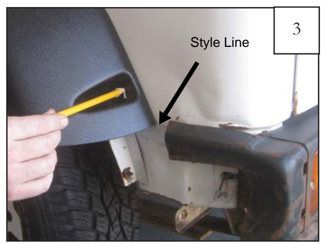
For rear of rear flare, use style line of vehicle as guide for where flare should line up. If there is a rear bumper endcap extending above this line then it will need to be trimmed.

Starting at rear of factory flare, pull up then out on flare to pop it off the metal lip. This will pull plastic rivets from the holes in factory flare. If rivets do not come out, remove them.