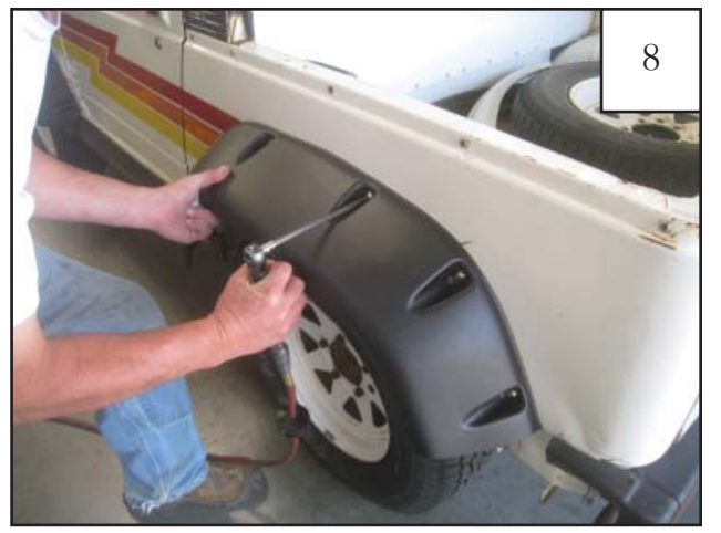
Hold the flare to the fender, lining screws up with 3/16" drilled holes and start screws into sheet metal. Once all screws are started, tighten to 2 ft•lb of torque.