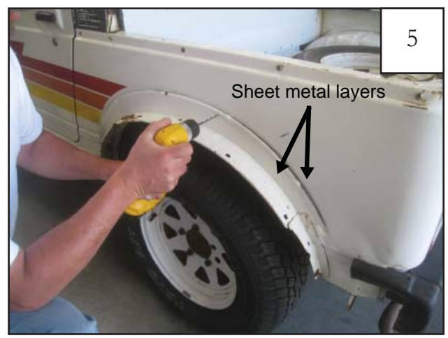
At each of the marked locations drill through sheet metal using a 3/16" bit. If necessary, drill through both layers of sheet metal because they overlap.