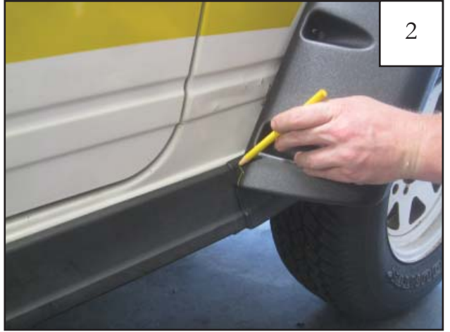
Optional Step in Cases Where Factory Rocker Moldings are Still on Vehicle: Hold flare in position on vehicle and mark where it interferes with rocker molding. Cut a notch into the flare on mark with utility knife.