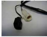
Heated / Electric