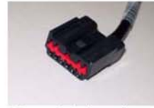
Heated / Electric