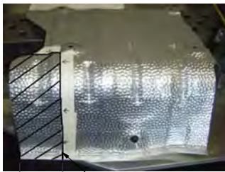
3-1/2" AREA TO TRIM HEAT SHIELD TRIMMING DIAGRAM