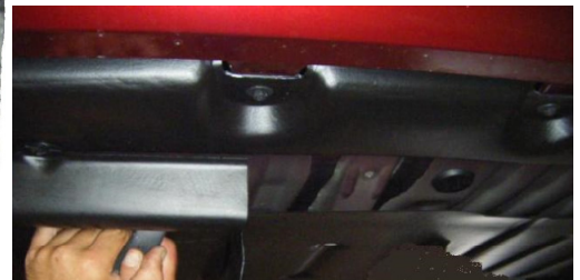
UNDERBODY TRIM DIAGRAM 2