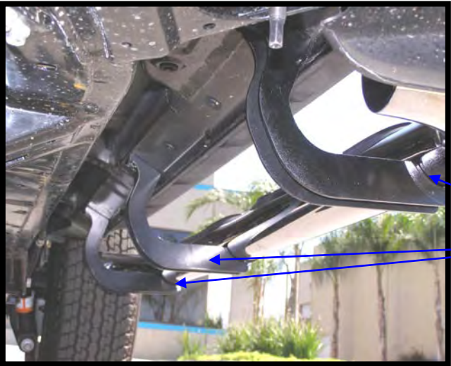
FIG. #2 DRIVER SIDE SHOWN