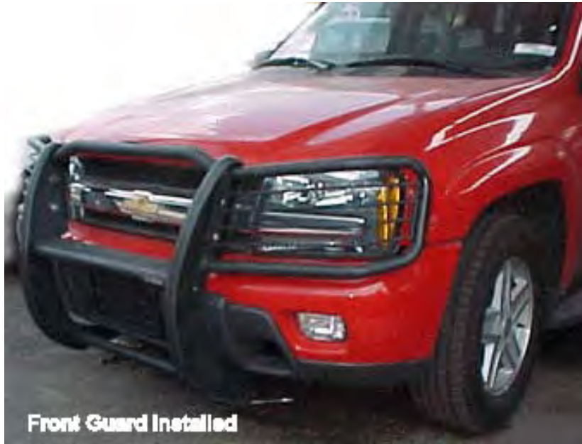
Front Guard Installed

6 - Make any final adjustments to the alignment of the grillguard on the vehicle and then tighten all of the bolts. Re-install the grille on the vehicle. Note: Make sure to allow for clearance when opening and closing the hood on the vehicle.