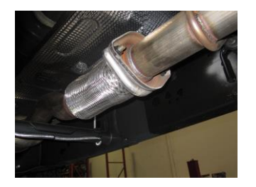
2. To remove your stock exhaust, unbolt the 2-bolt flange located in front of the muffler. Then cut off your tailpipe. Leave all rubber grommets in place. Use WD-40 to aid in the removal of the hangers from the rubber grommets.

1. Disconnect the negative battery cable before removal of OEM exhaust. This will allow the computer to reset and recognize the new exhaust. Lay out the exhaust on the floor so it looks like the drawing and compare parts with manual.