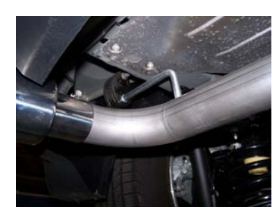
7. Install muffler assembly #E onto extension pipe. Insert hangers into rubber grommets. Use clamp #H to secure pipes together. Do not tighten.

6. Install extension pipe #D onto extension pipe #C. Use clamp #H to secure pipes together. Do not tighten. Insert welded hanger into rubber grommet.