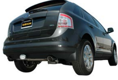
8. Install stainless steel tips. Clamp down. When you have everything in place, firmly tighten all bolts and clamps down securely. Use stainless steel cleaner and a Scotch Brite pad weekly to prevent tip from discoloration. Inspect all fasteners after 25-50 miles of operation and retighten as necessary.

5. Install extension pipe #C onto muffler outlet. Use clamp #H to secure the pipe to the muffler.