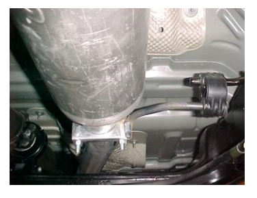
Next install front muffler hanger #F onto muffler. Insert hanger into rubber grommets. Do not tighten.

Install exit pipes # E onto tailpipe, use clamps # H to secure pipes together, do not tighten. Use zip ties to secure brake and fuel lines away from exhaust.