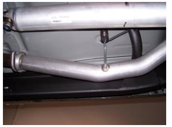
3. Install head pipe #A, using the two stock bolts. Insert hangers into rubber grommets. Do not tighten.

7. Install driver side over axle tail pipe #D into muffler 1\frac{1}{2} -2". Support end of tail pipe with jack stand and attach to clamp #G.